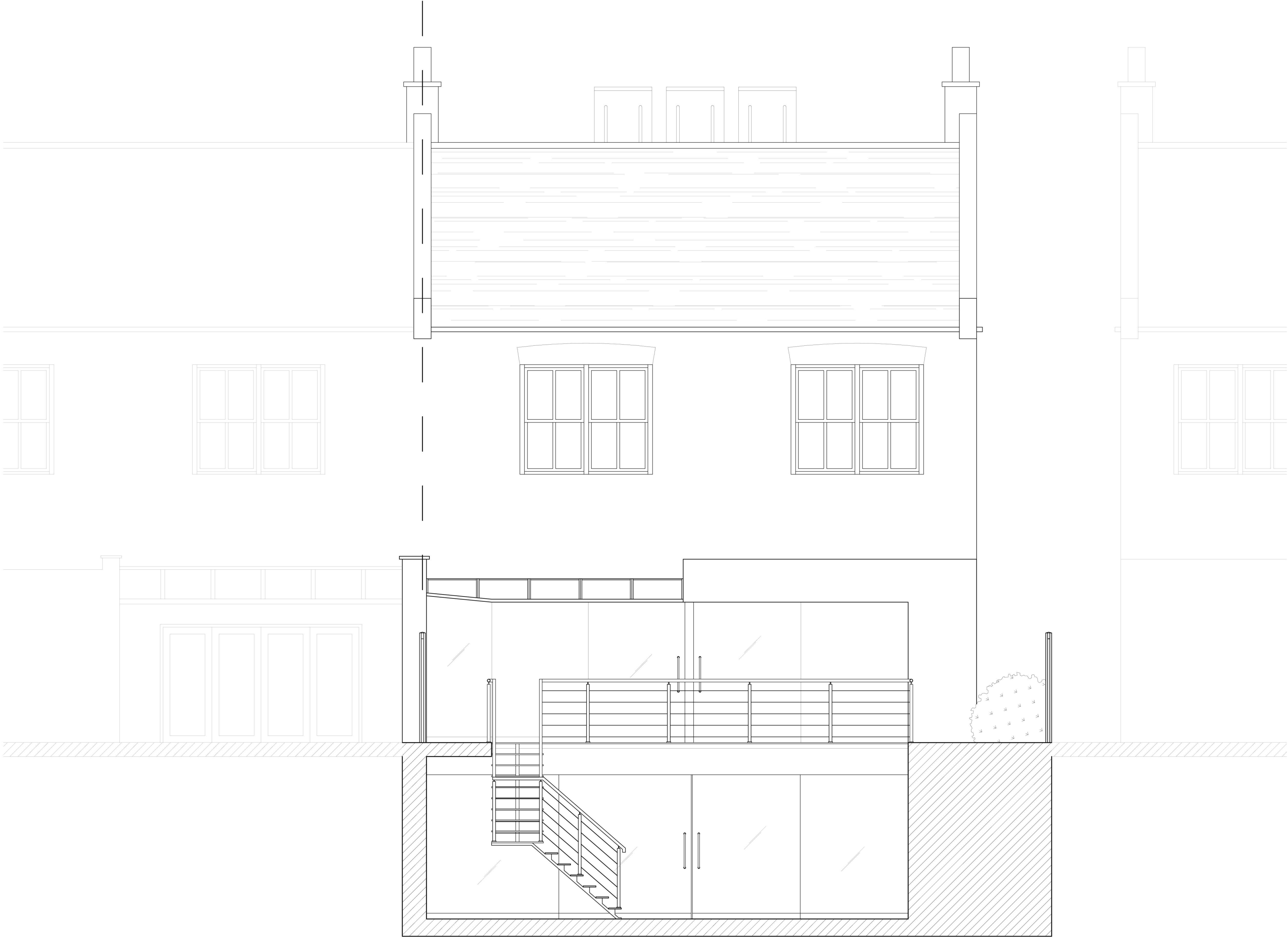
SECTION CC: AS PROPOSED 1:50