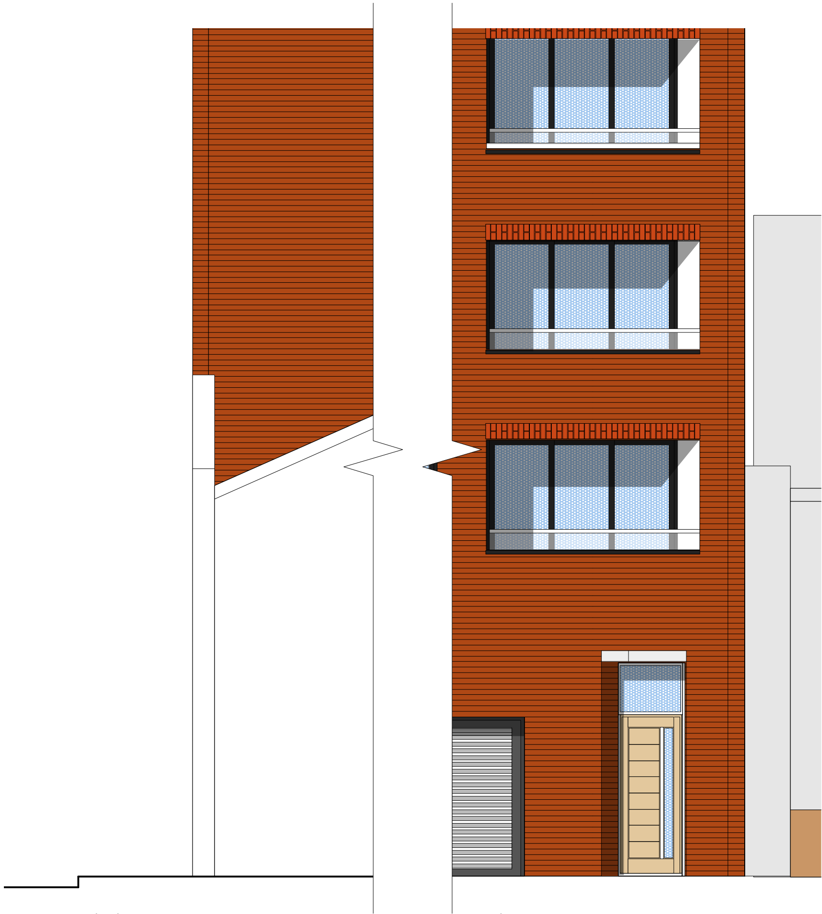
Side Elevation Scale 1:50