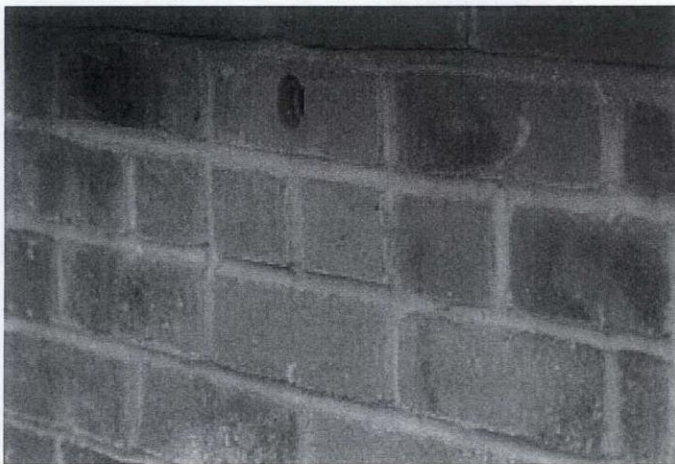
Sparrow box incorporated within fabric of building.

I also enclose the completed Conditions Application Form and a cheque for the sum of £97.00 only with 3 copies of supporting documentation.