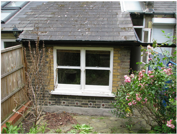
View from rear garden to single storey extension