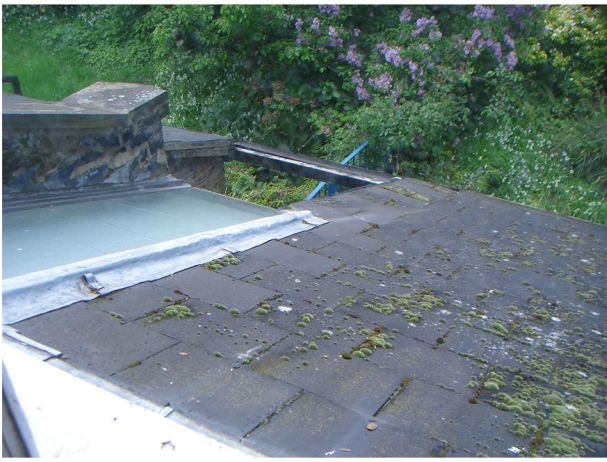
Existing single glazed rooflight