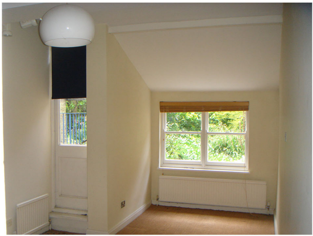
Internal view of single storey extension showing only access to garden.