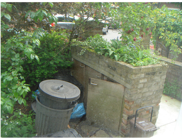
Area in front of existing bin store