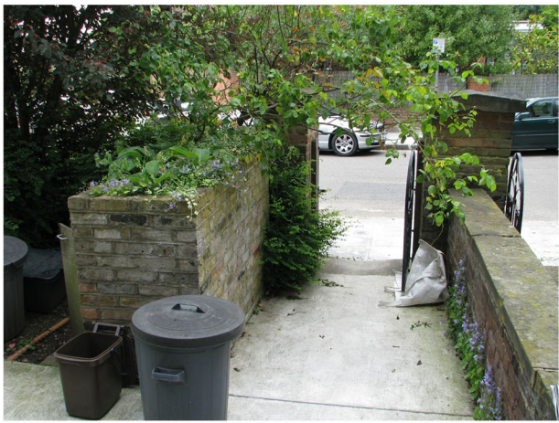
View from the pathway to bin store