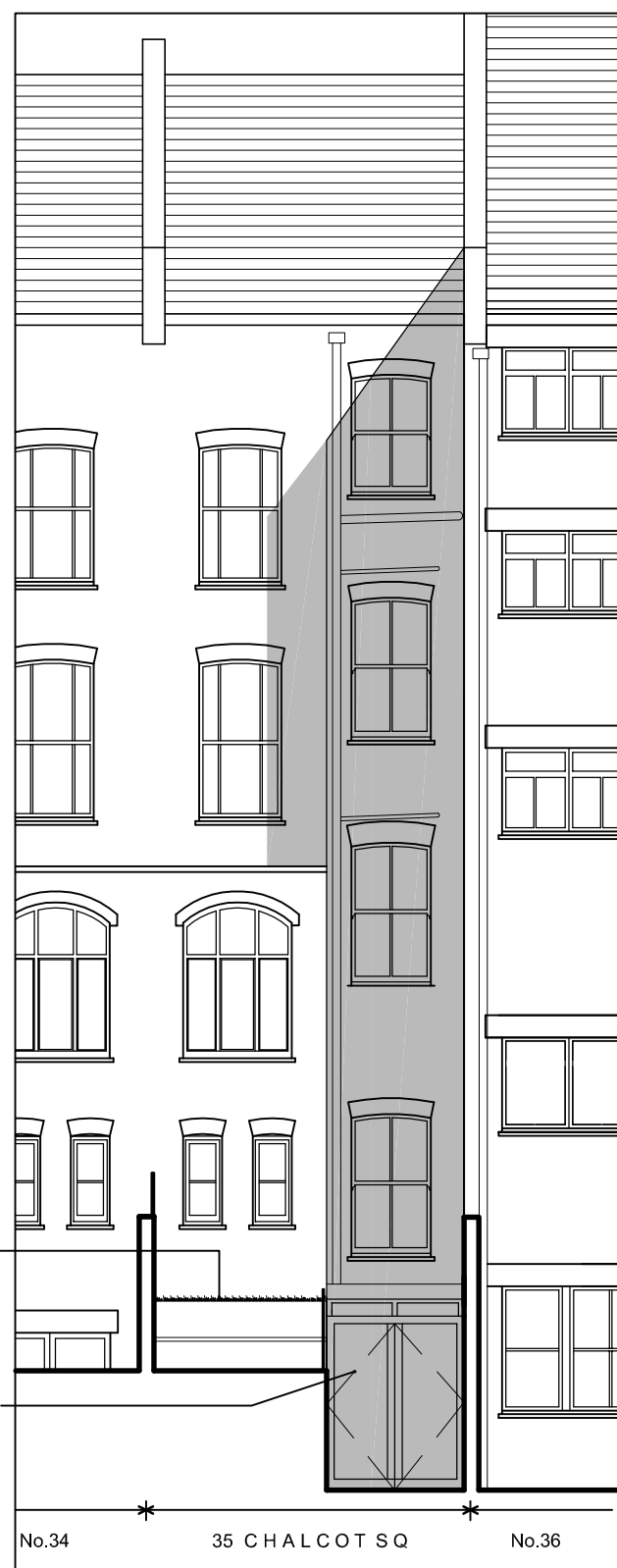
PROPOSED SECTION BB

DRAWING TITLE : PROPOSED SECTIONS AA, BB & EE AND SOUTH EAST (FRONT) ELEVATION