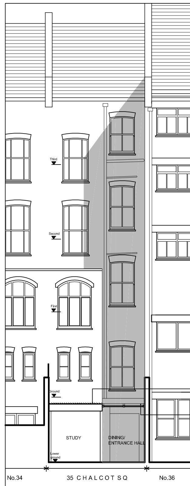
PROPOSED SECTION AA