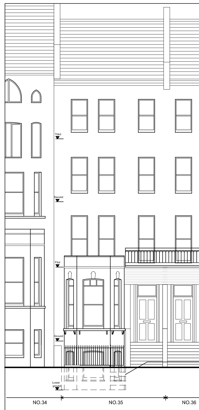
SOUTH EAST (FRONT) ELEVATION (Same as existing)

EXISTING TIMBER GLAZED ENTRANCE DOOR REPLACED WITH TIMBER SASH WINDOW EXISTING TIMBER GLAZED ENTRANCE DOOR (BELOW STAIRS) NOT VISIBLE ON A TRUE FRONT ELEVATION