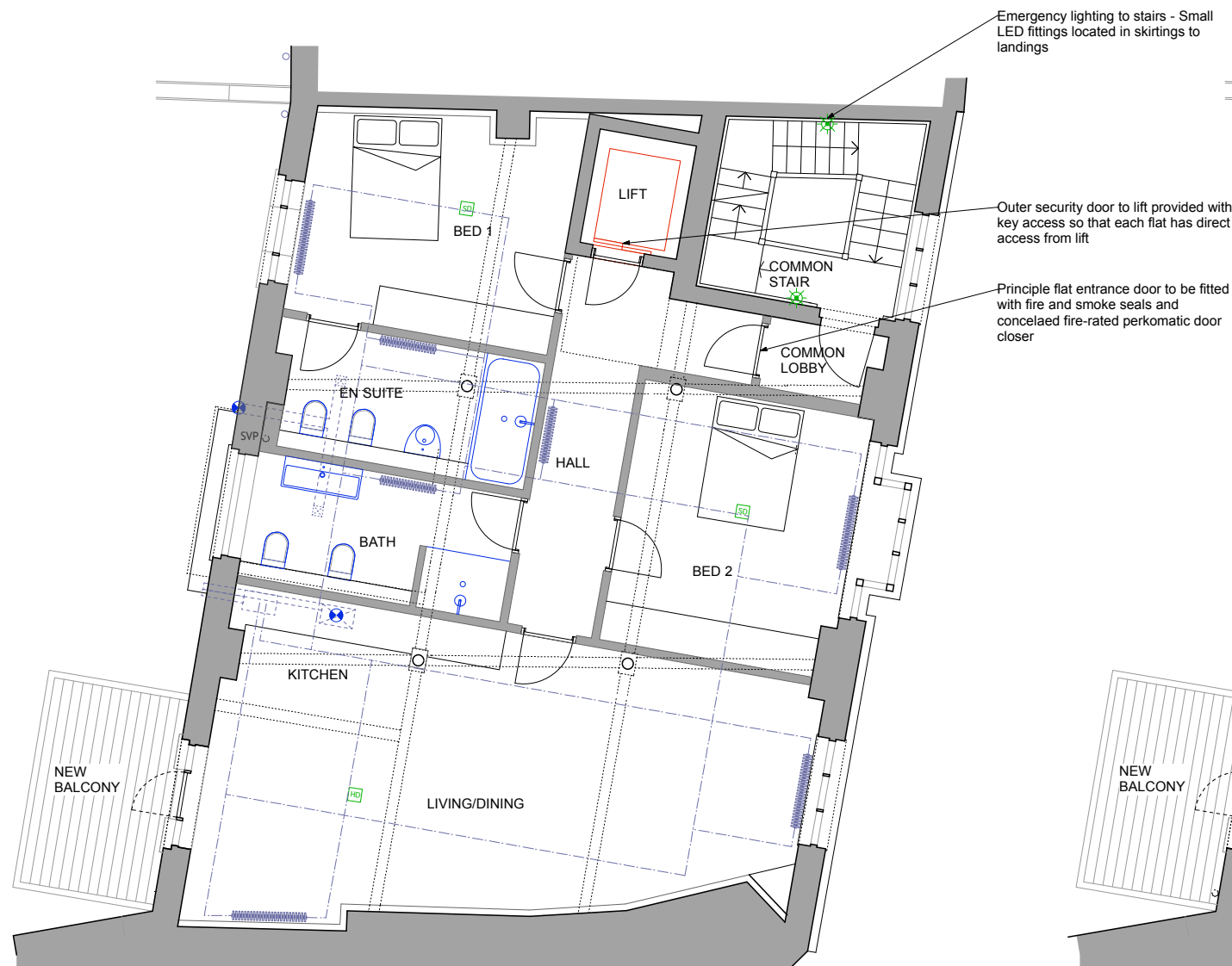
25 No4 FLITCROFT STREET PROPOSED FIRST FLOOR PLANS