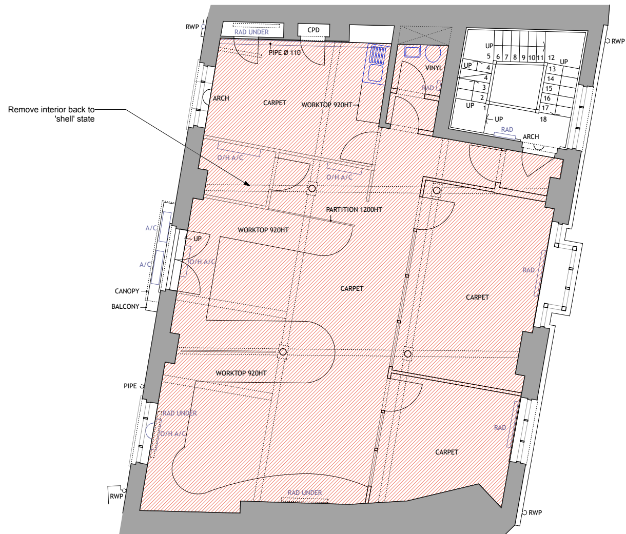
15 No4 FLITCROFT STREET FIRST FLOOR PLANS SHOWING EXTENT OF STRIP OUT