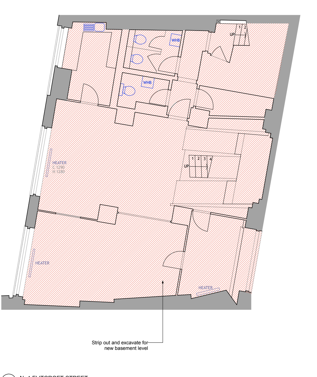
13 No4 FLITCROFT STREET BASEMENT PLANS SHOWING EXTENT OF STRIP OUT