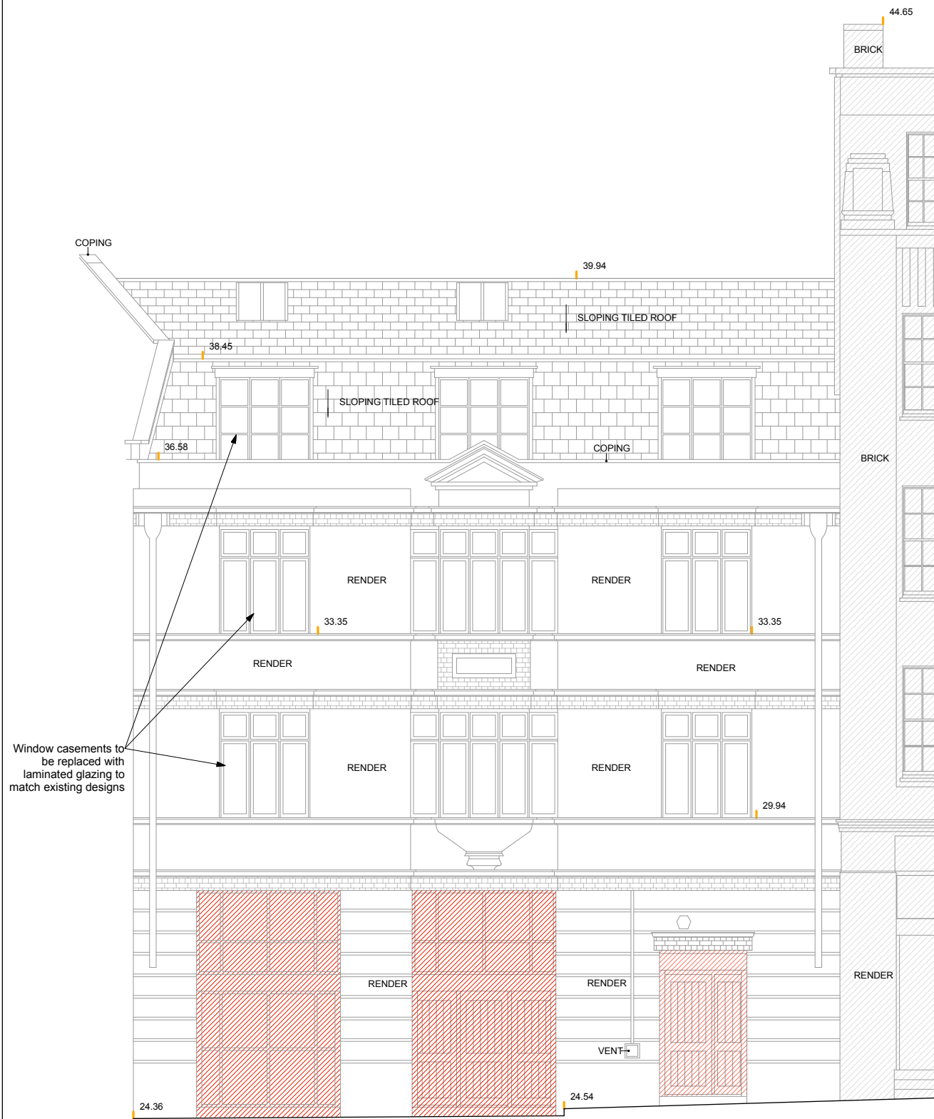
10 No4 FLITCROFT STREET EXTERNAL FRONT ELEVATION SHOWING EXTENT OF STRIP OUT