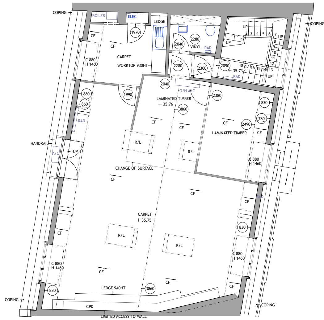
8 No4 FLITCROFT STREET EXISTING THIRD FLOOR PLANS