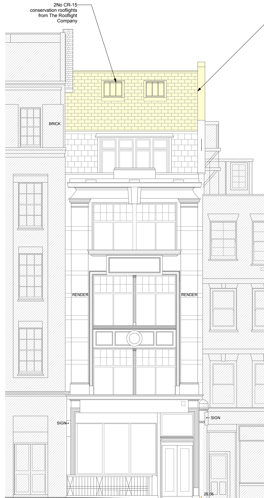
23 No4 DENMARK STREET PROPOSED EXTERNAL FRONT ELEVATION