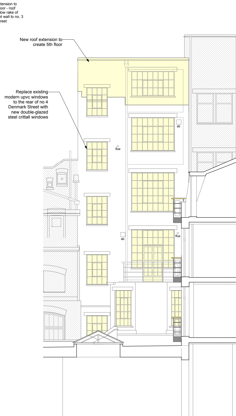
24 No4 DENMARK STREET PROPOSED EXTERNAL BACK ELEVATION