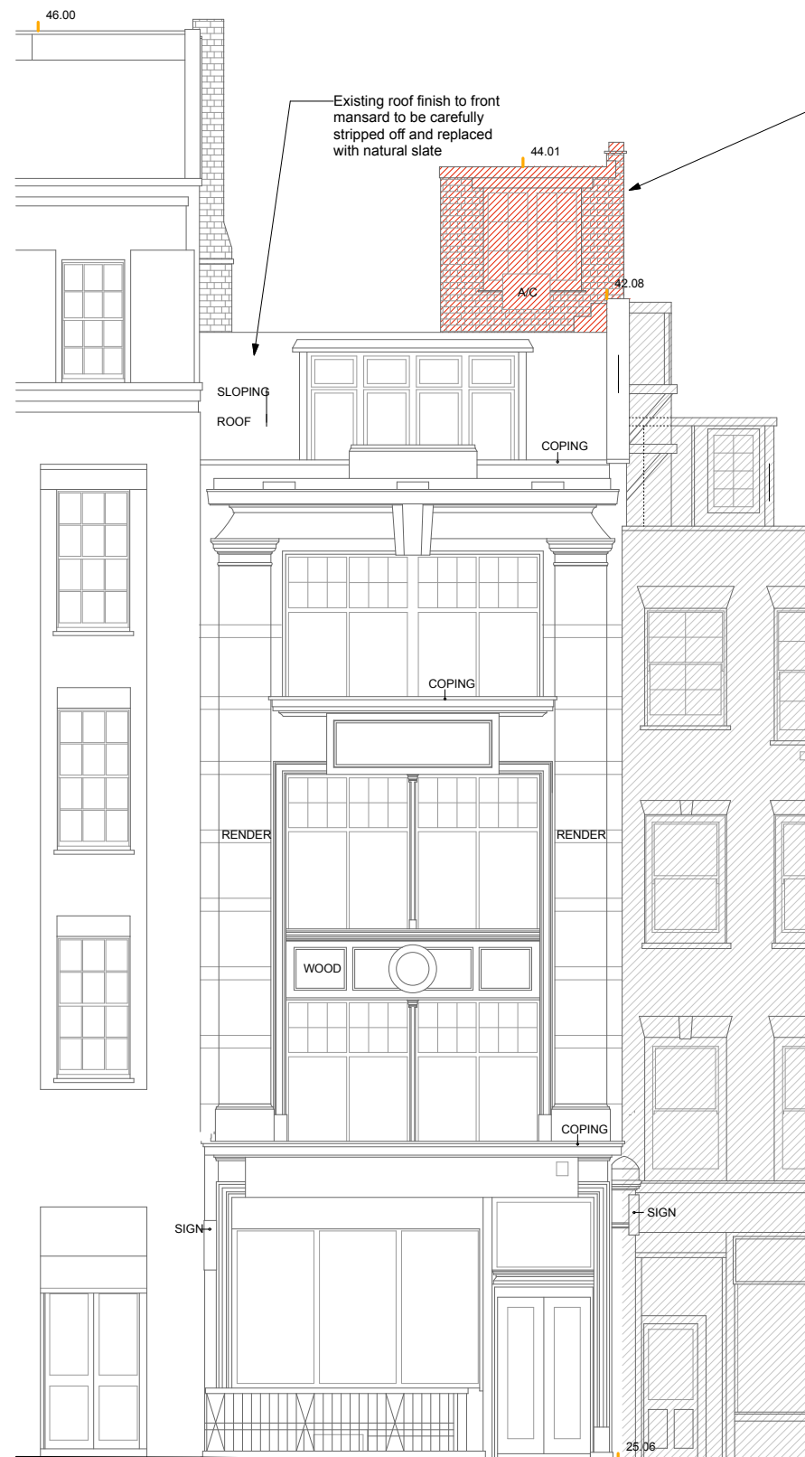
12 No4 DENMARK STREET EXTERNAL FRONT ELEVATION SHOWING EXTENT OF STRIP OUT

Demolish existing roof access stairwell to enable new roof extension to create 5th floor