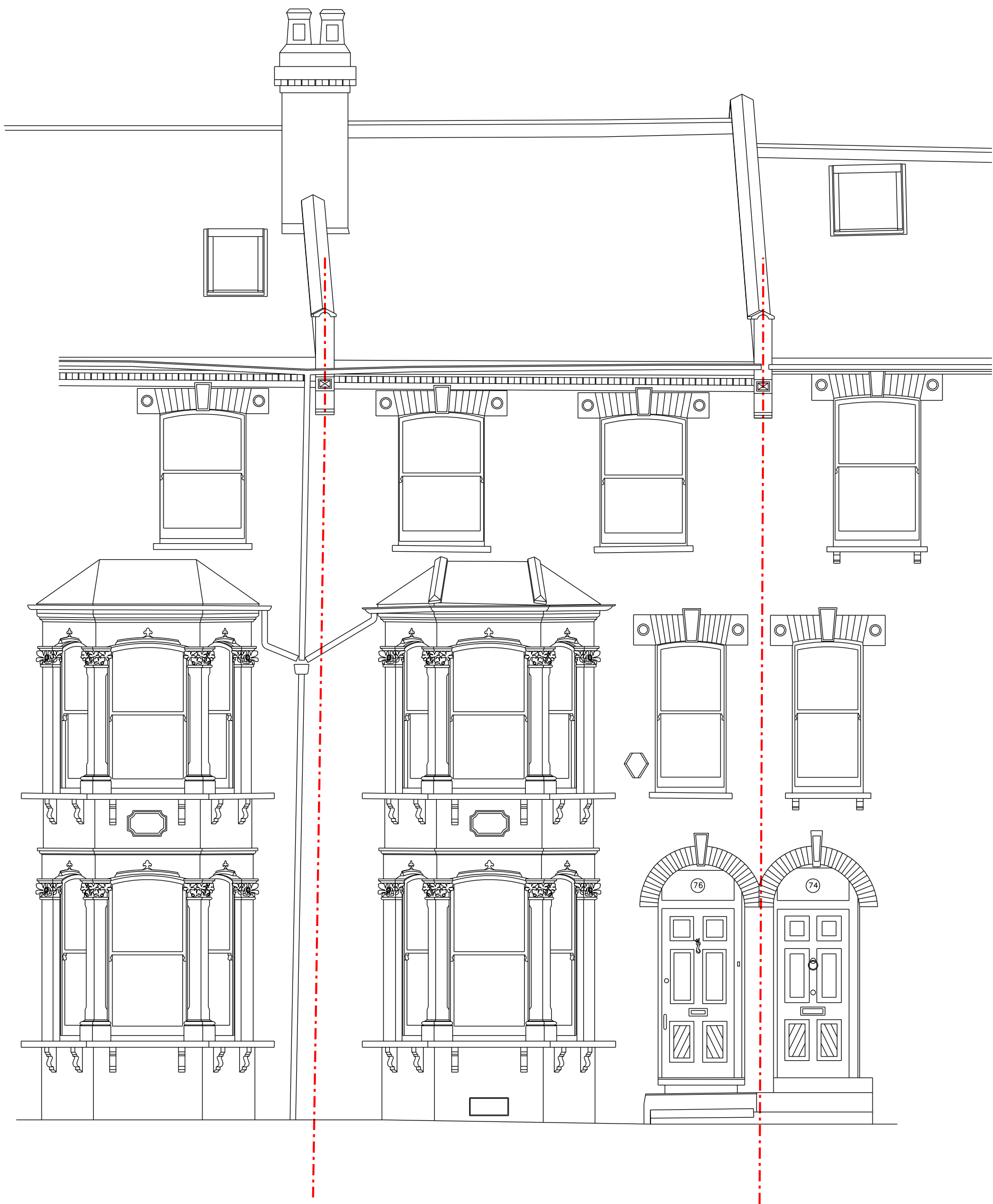
ELEVATION TO BURGHLEY ROAD