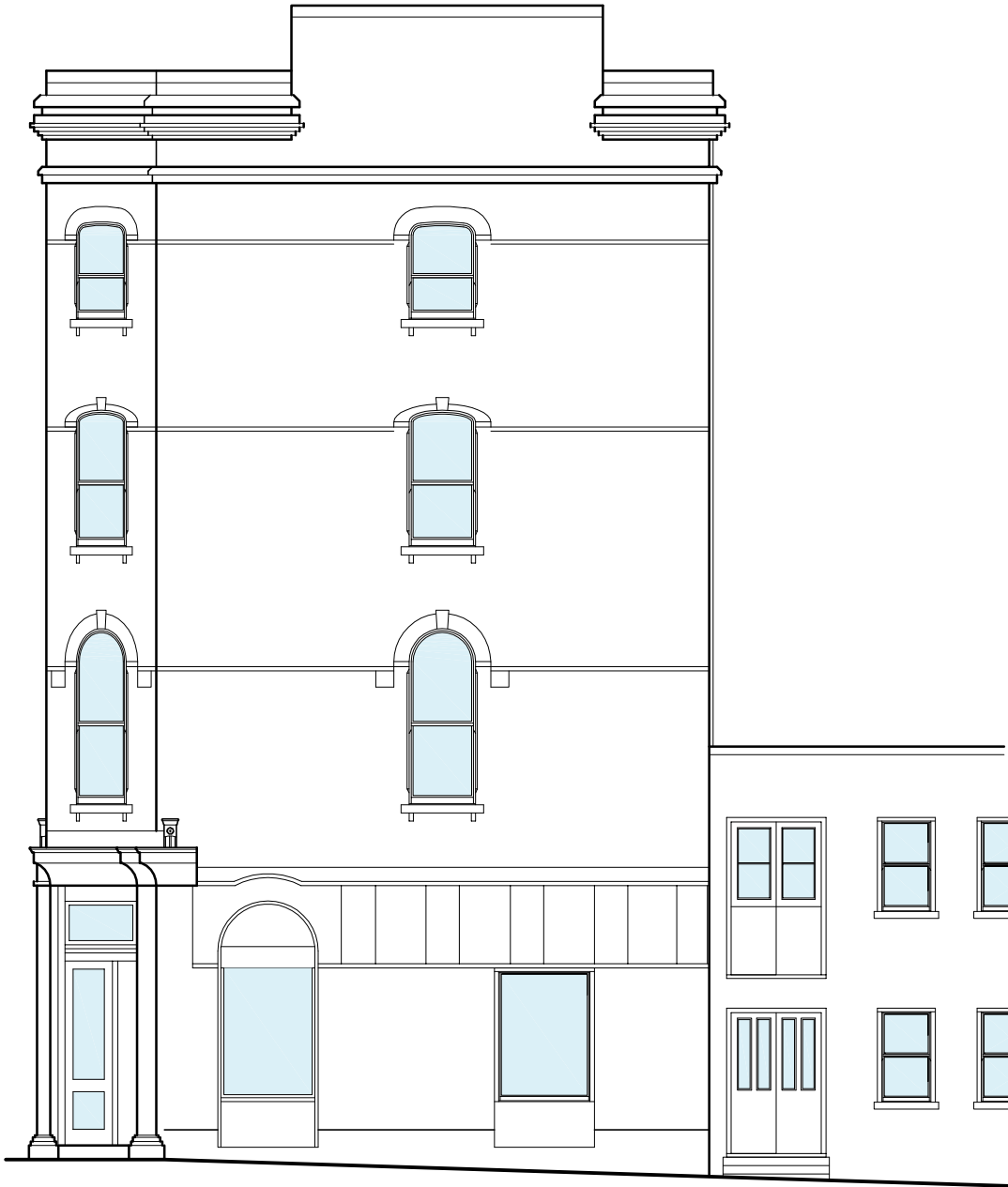
Proposed Side Elevation Viewed From Sharples Hall Street