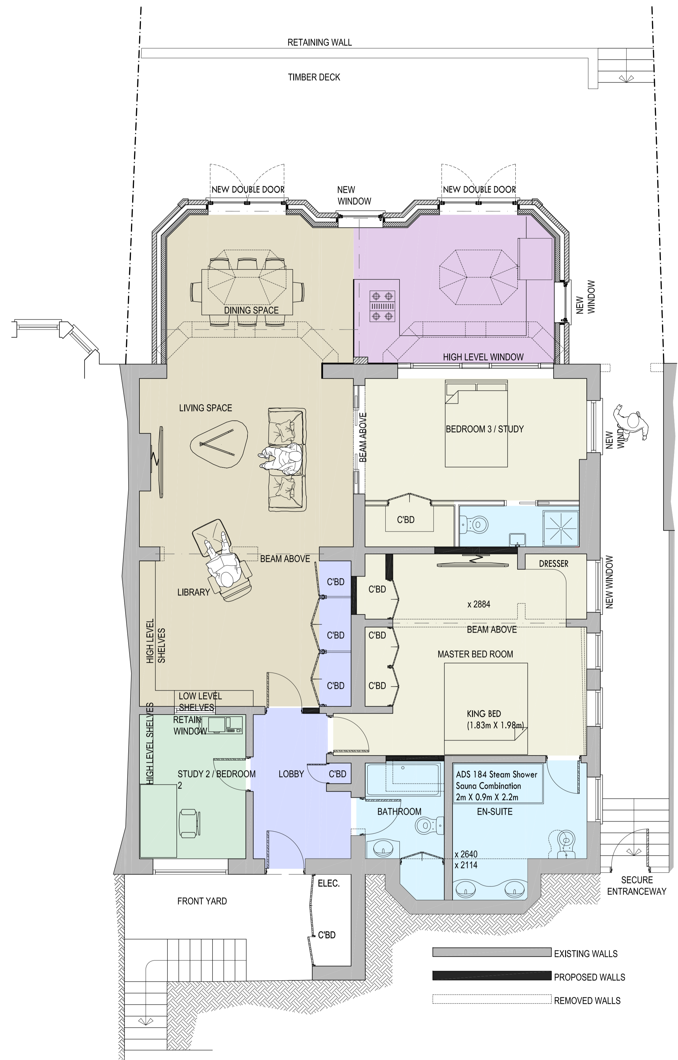
LOWER GROUND FLOOR PLAN AS PROPOSED EXTENSION 25.95m 2 / 279.27sqft

site/project: 2A CHESTERFORD GARDENS, HAMPSTEAD, NW3