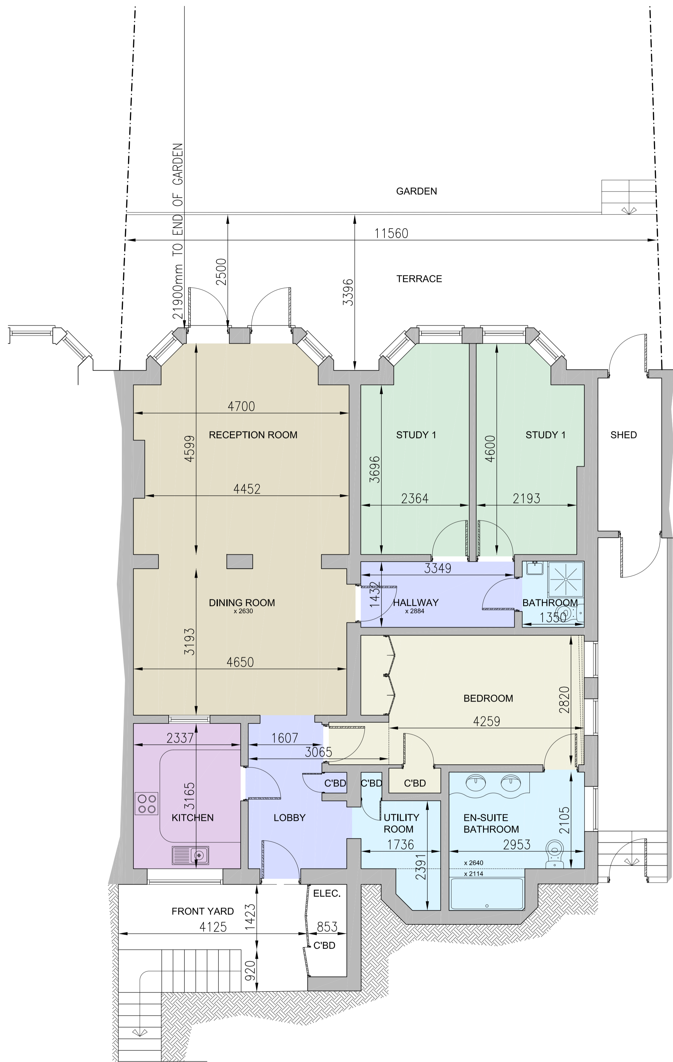
LOWER GROUND FLOOR PLAN AS EXISTING 105.06m 2 / 1130.80sqft