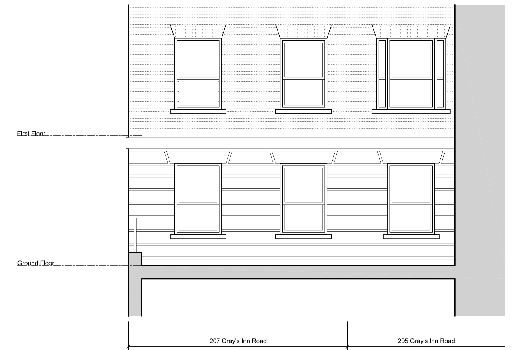
Elevation A (Rear) - Existing