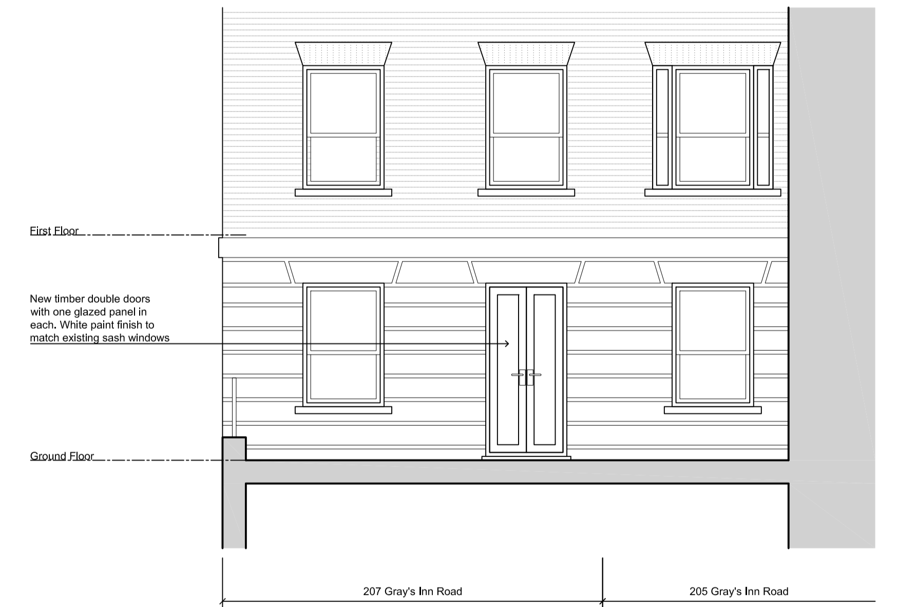
Elevation A (Rear) - Proposed

Project: 207 Gray's Inn Road, London Drawing: Ground Floor Plan and Rear Elevation - Existing & Proposed Ref: 001-P-100 - Rev A Date: 17.12.12 1:50 @ A1 / 1:100 @ A3