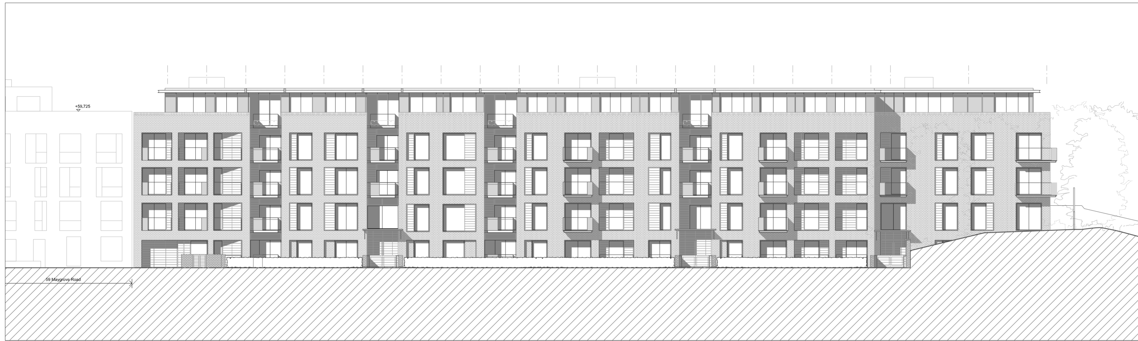
A4005 South Elevation AA