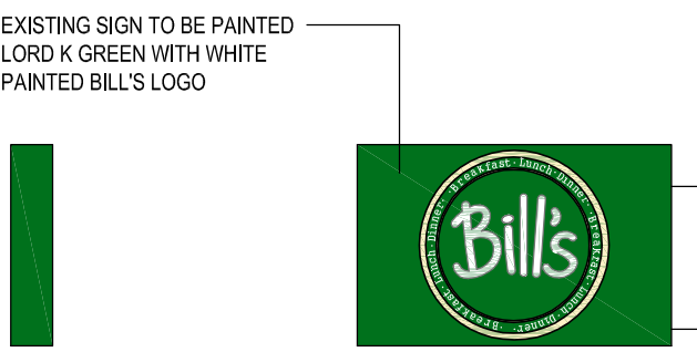
DETAIL 'B' SCALE 1:20

GENERAL NOTES ALL DIMENSIONS TO BE CHECKED ON SITE PRIOR TO COMMENCEMENT OF WORKS - PLEASE REPORT ERRORS OR OMISSIONS TO THE ARCHITECT. THIS DRAWING HAS BEEN PRODUCED FOR THE PURPOSES OF PLANNING AND BUILDING REGULATIONS APPROVALS ONLY AND IS NOT INTENDED TO BE A FULL WORKING DRAWING. THIS DRAWING IS TO BE READ IN CONJUNCTION WITH ANY WRITTEN SPECIFICATIONS, SCHEDULES OF WORK AND STRUCTURAL ENGINEER'S DETAILS AS APPROPRIATE. THIS DRAWING IS THE COPYRIGHT OF PUMP HOUSE DESIGNS AND ANY FURTHER REPRODUCTION OF THE PLAN IS NOT PERMITTED WITHOUT OBTAINING PRIOR CONSENT.