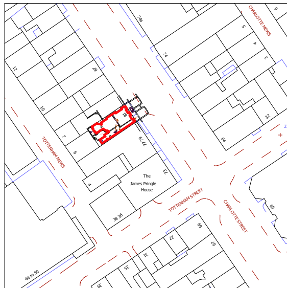
OS location map 1:1250