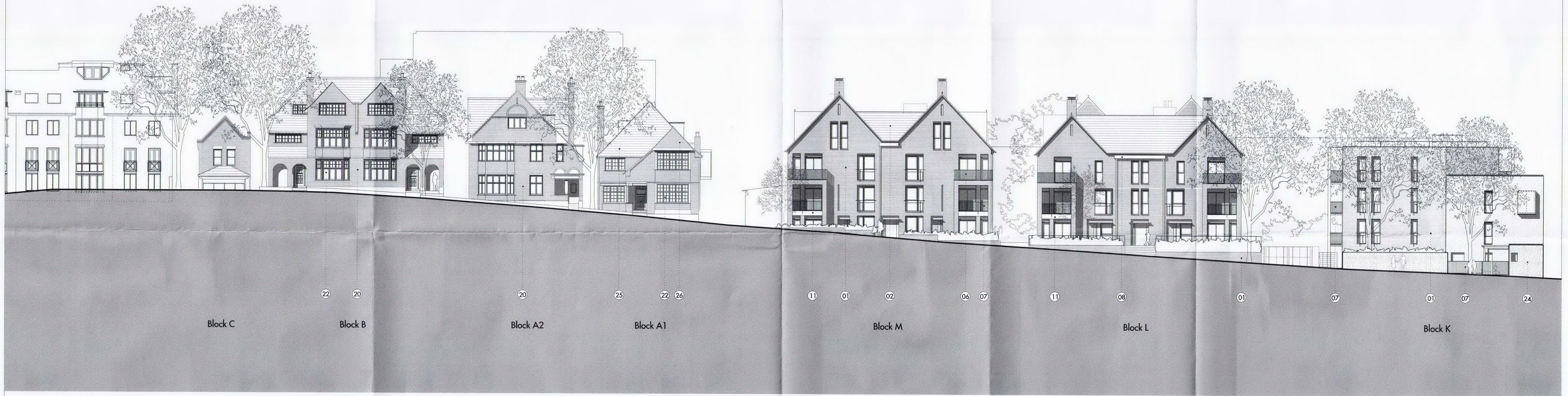
Kidderpore Avenue Elevation