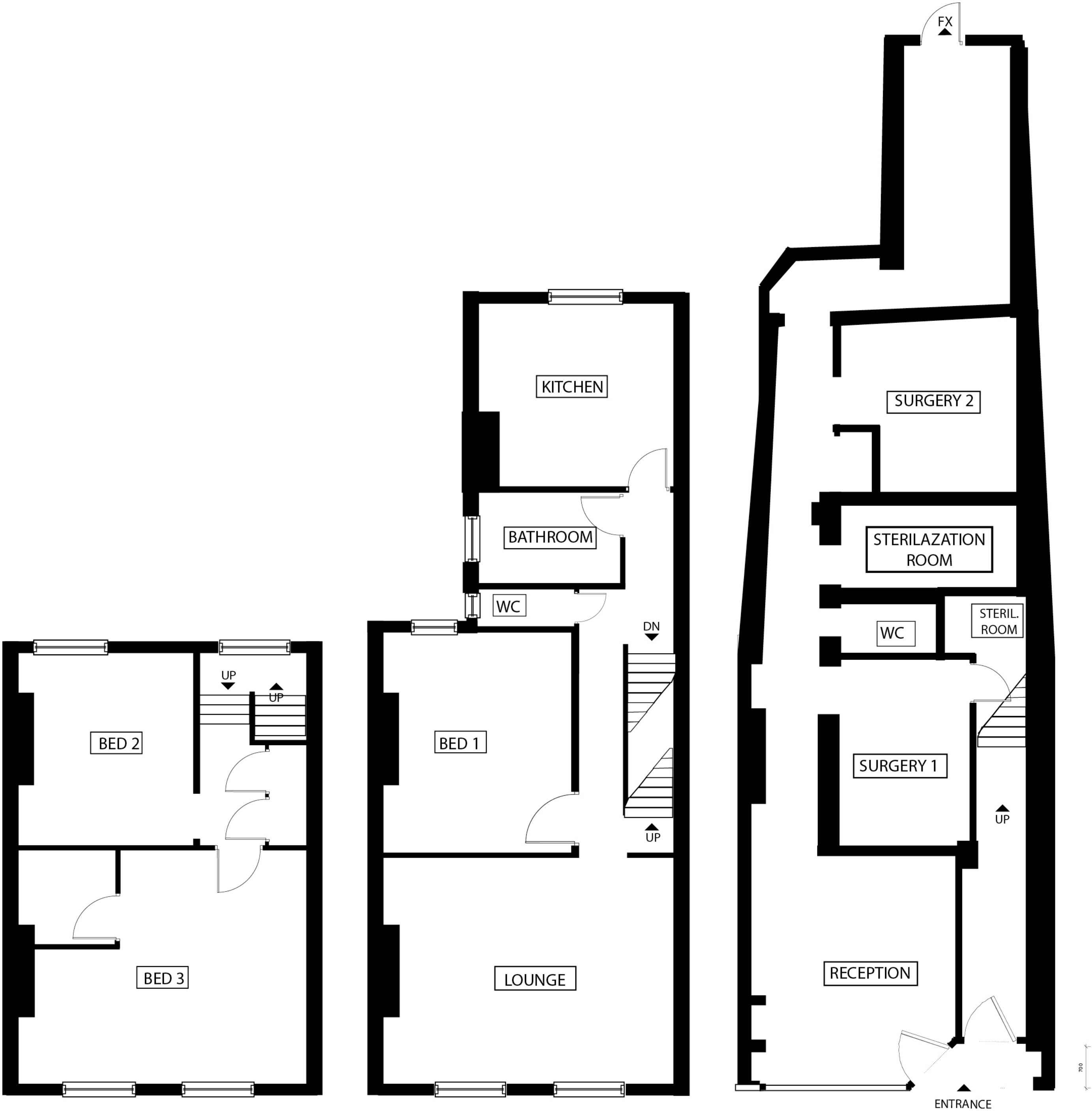
second 45 sqm