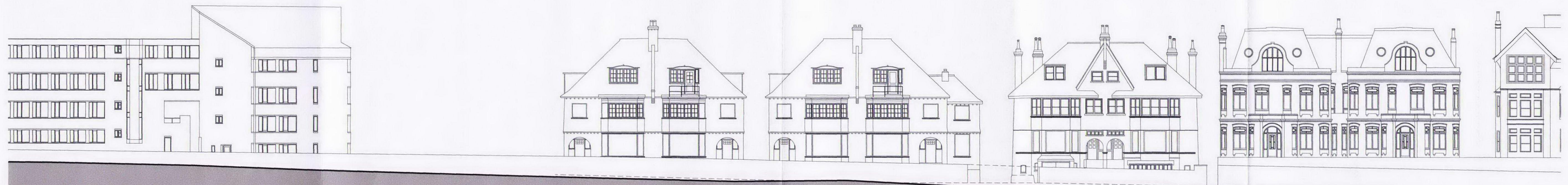
Finchley Road SW Elevation