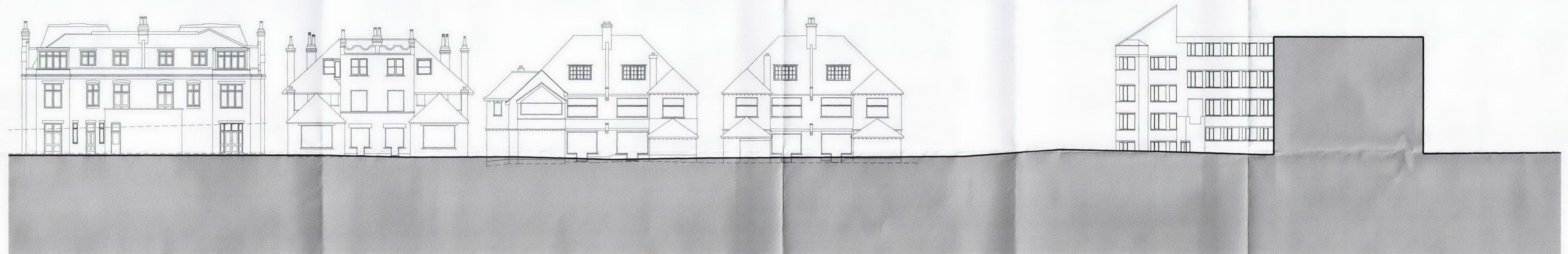
Finchley Road NE Elevation