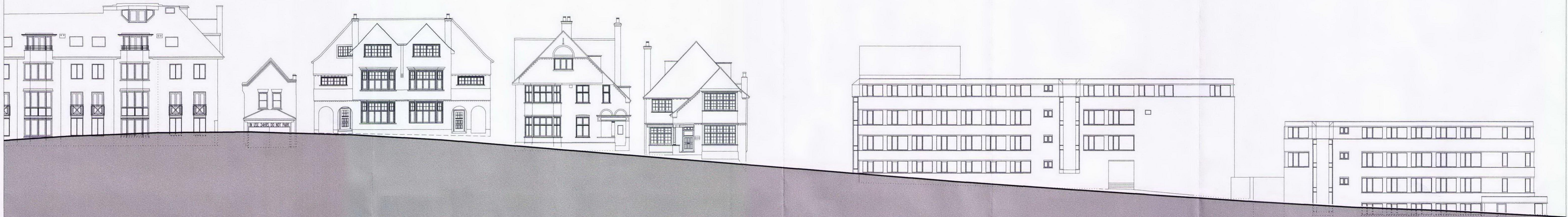
Kidderpore Avenue Elevation NE