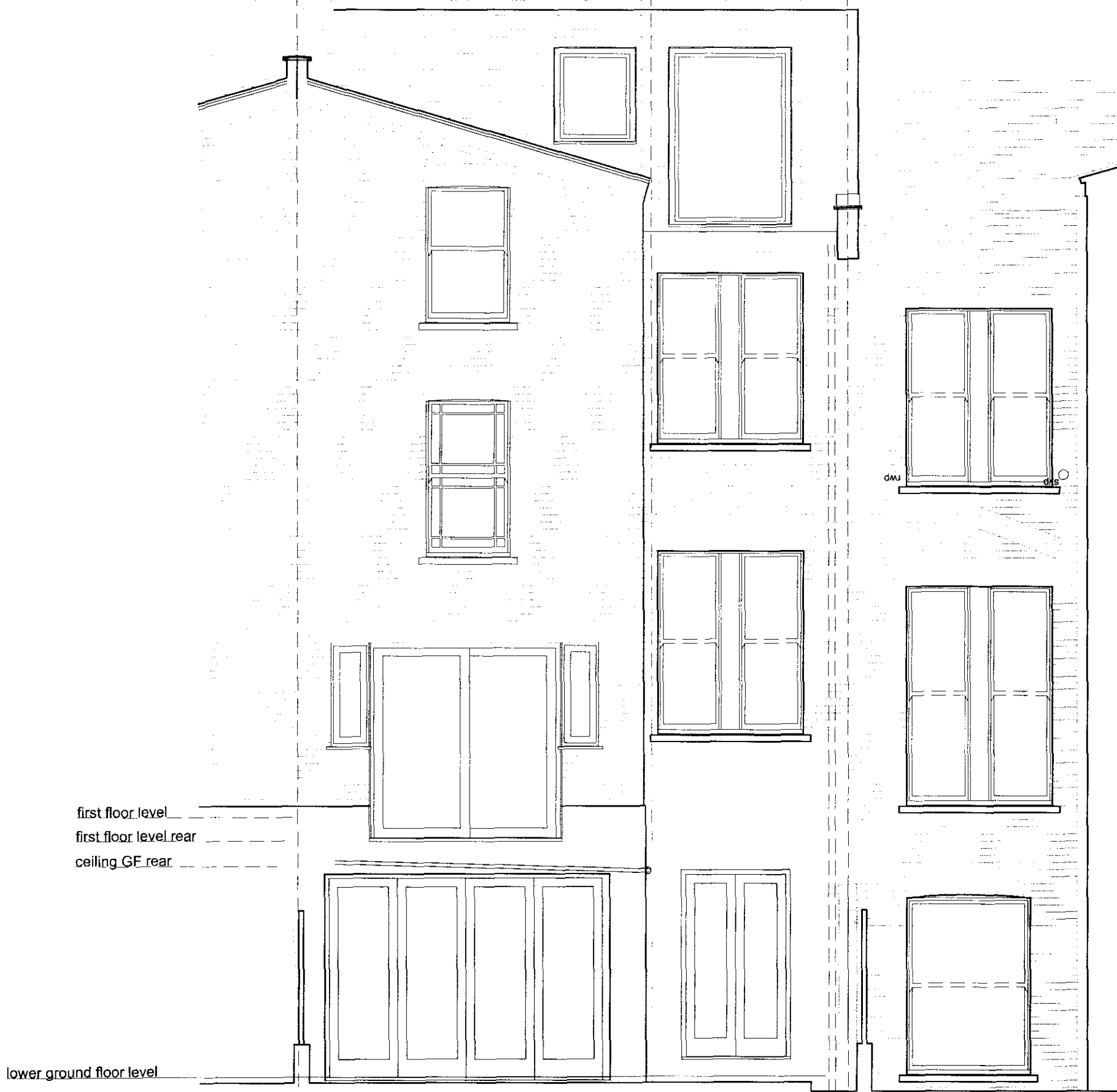
Existing Rear Elevation Northern Aspect