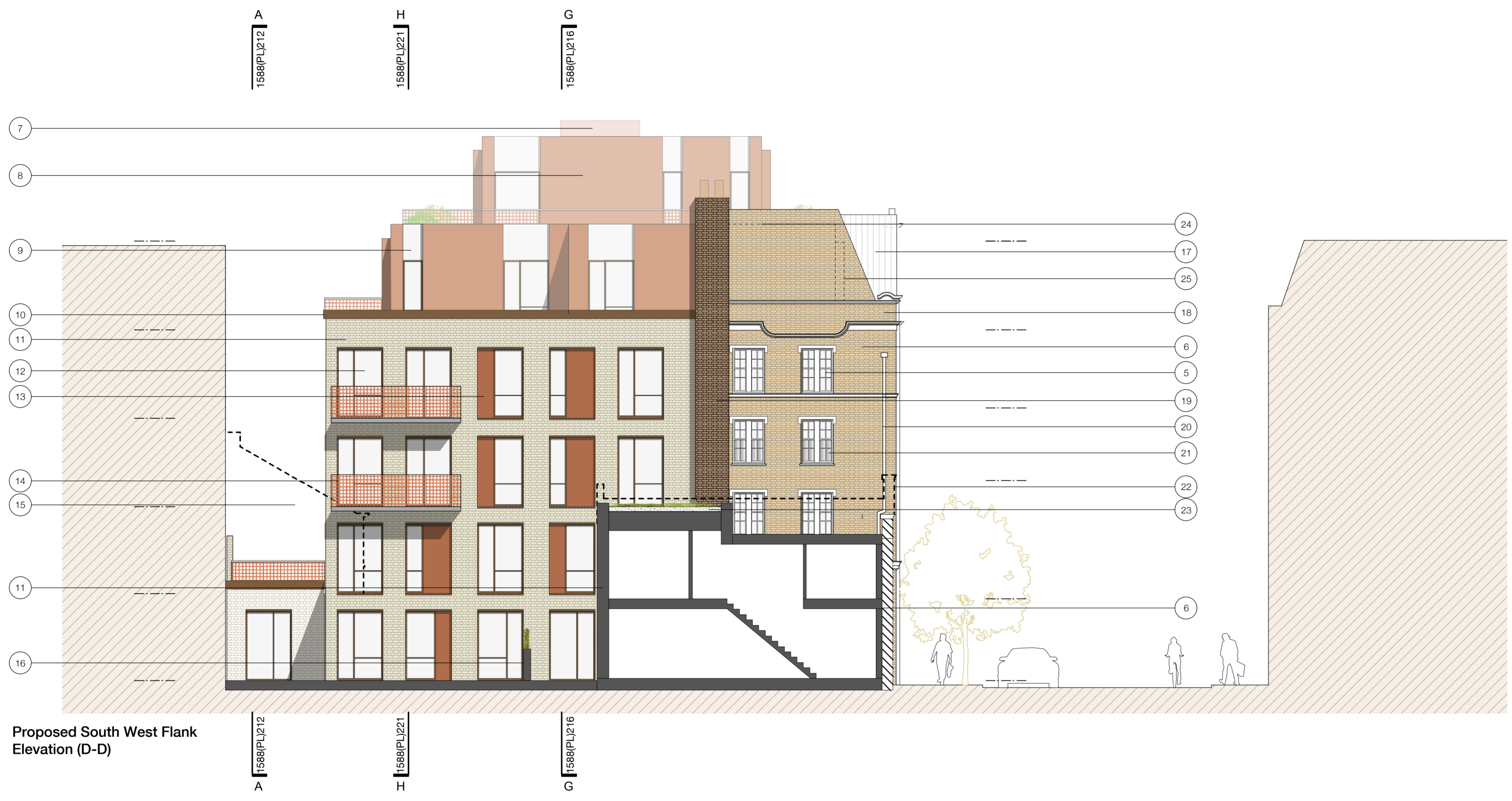
Proposed South West Flank Elevation (D-D)