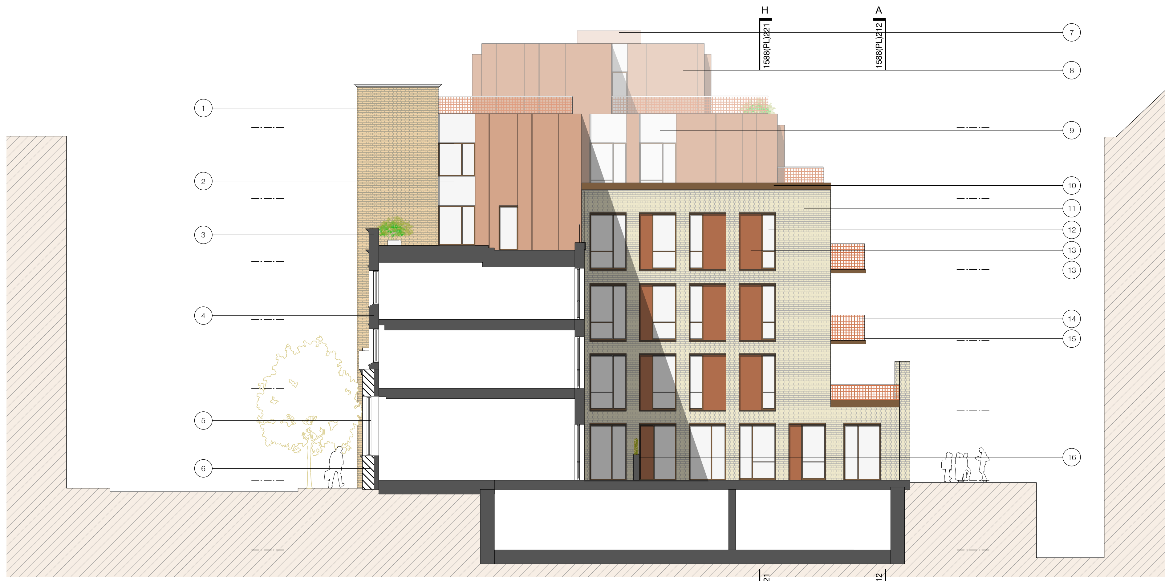
North East Flank Elevation (C-C)