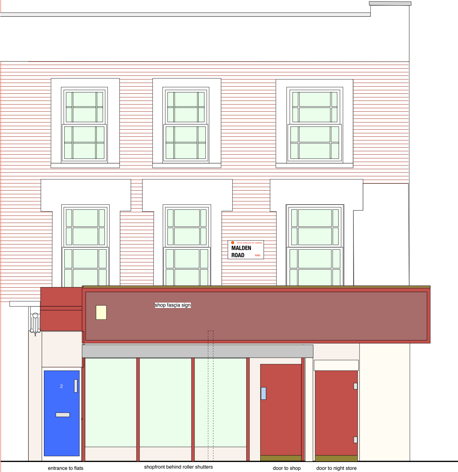
ELEVATION TO MALDEN ROAD