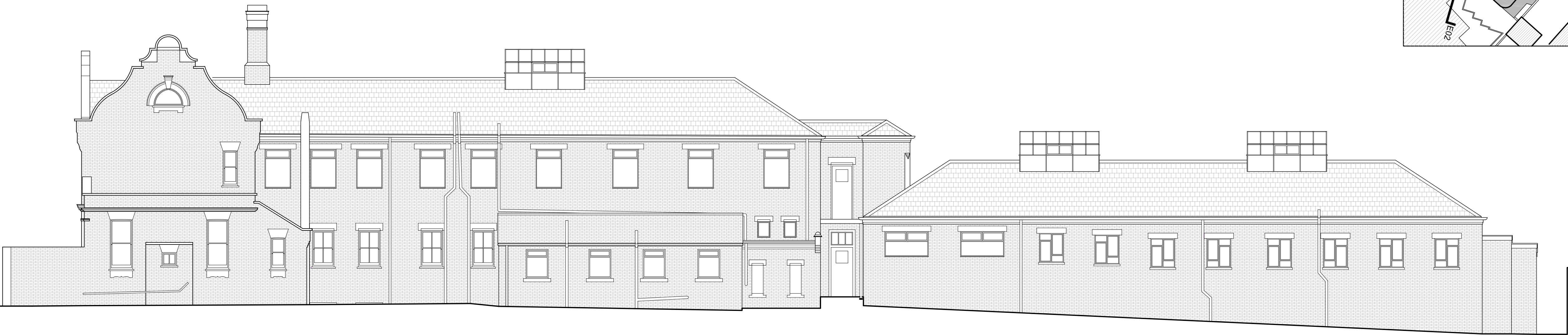
EXISTING ELEVATION 02 (West Elevation facing Yard)