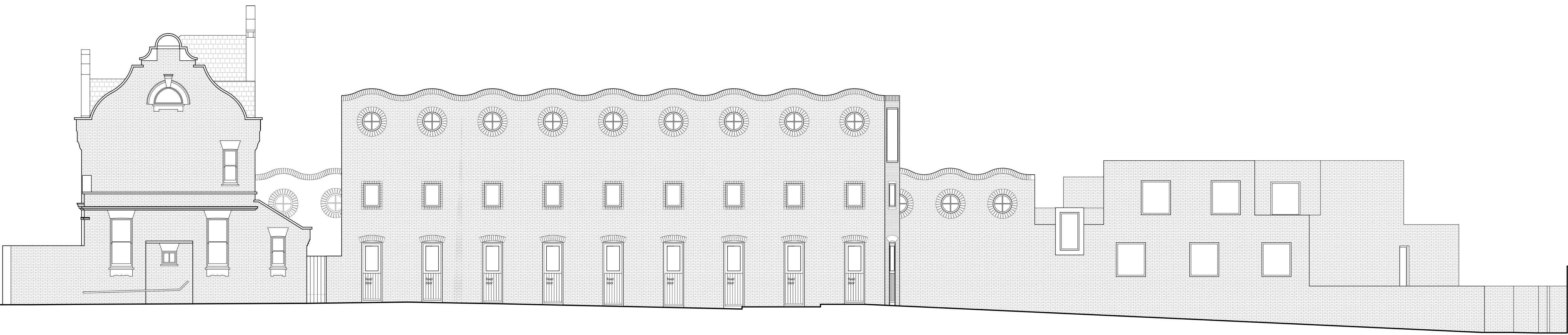
PROPOSED ELEVATION 02 (West Elevation facing Yard)