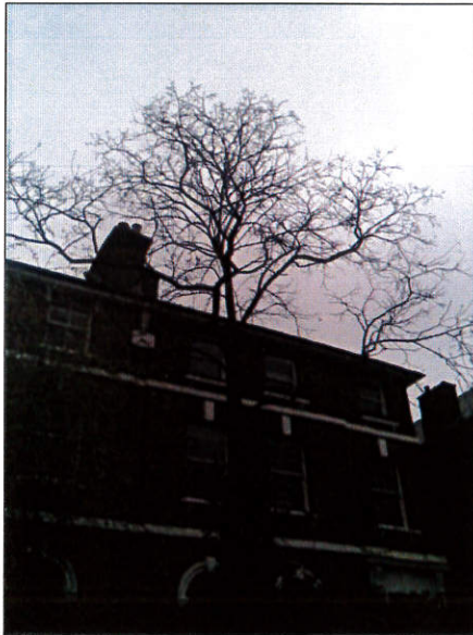
T2 - False Acacia