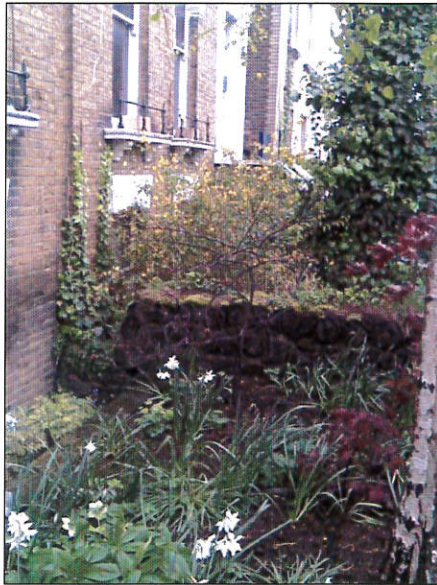
SG1 - Mixed Species Group (H)