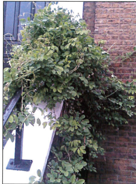
C1 - Climbing shrub