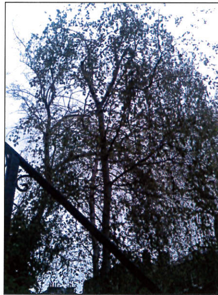
T1 - Birch (Silver)