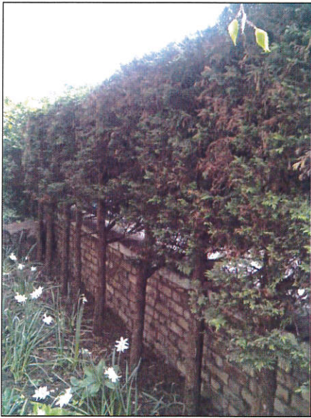
H1 - Cypress