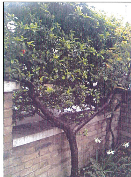
S1 - Pyracantha