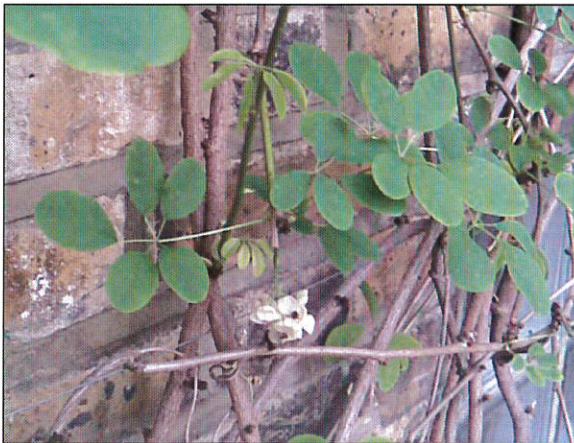
C1 - Climbing shrub