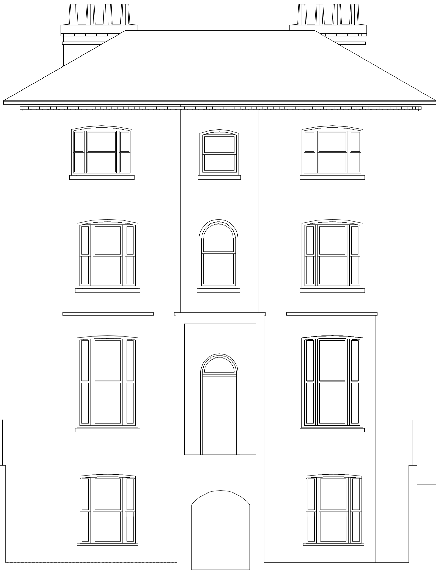
1 EXTG FRONT EXTN SECTION EE Scale: 1:50