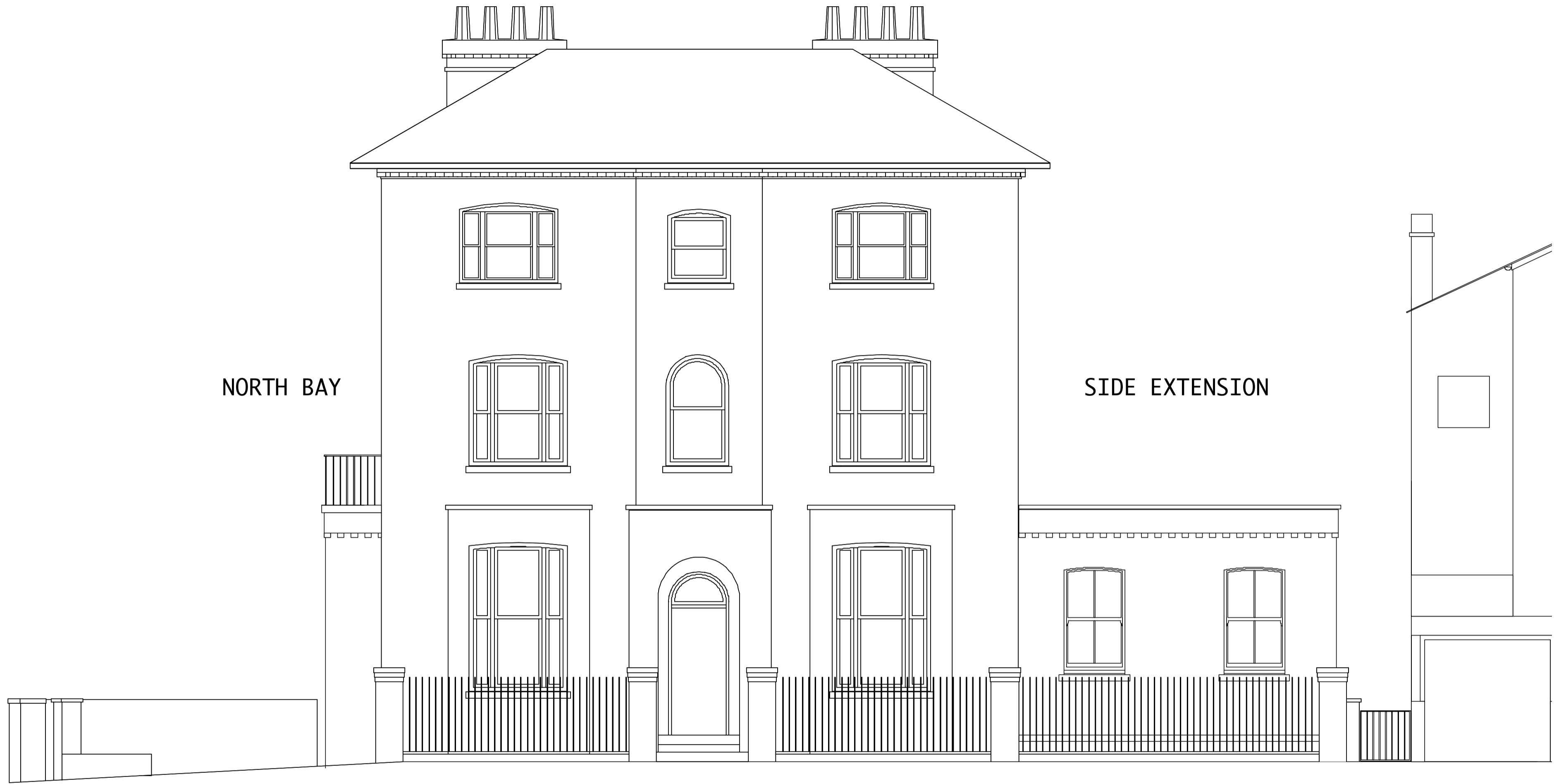
1 FRONT ELEVATION (GAYTON CRESCENT)