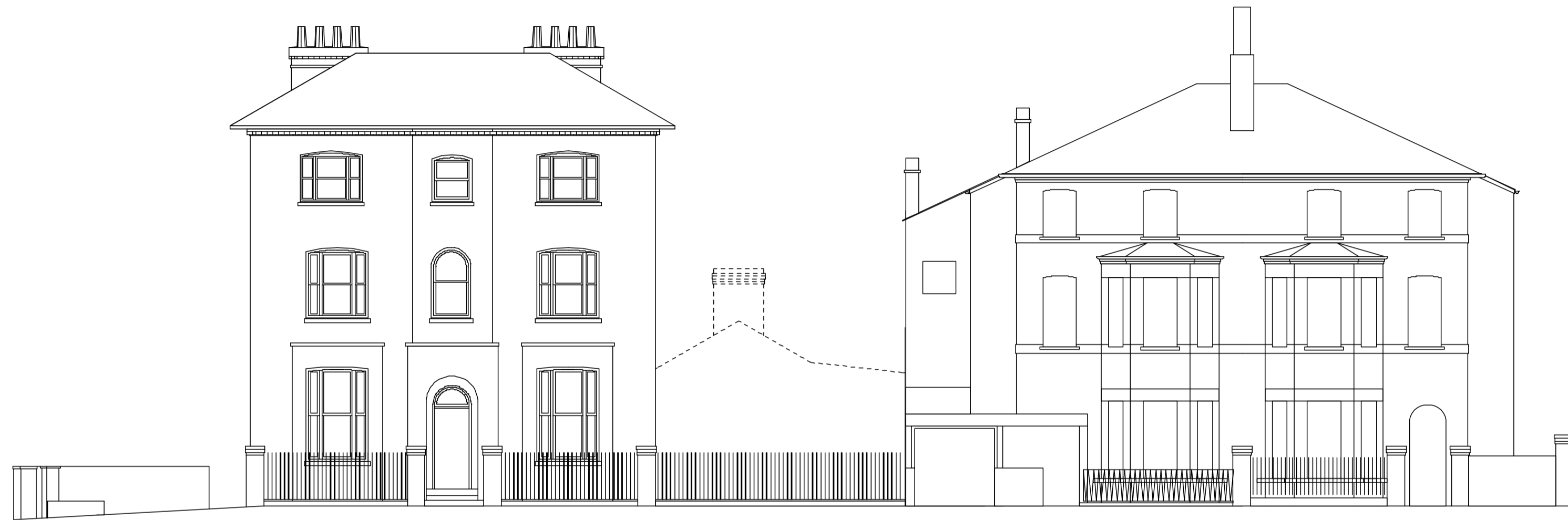
1 FRONT ELEVATION (GAYTON CRESCENT)