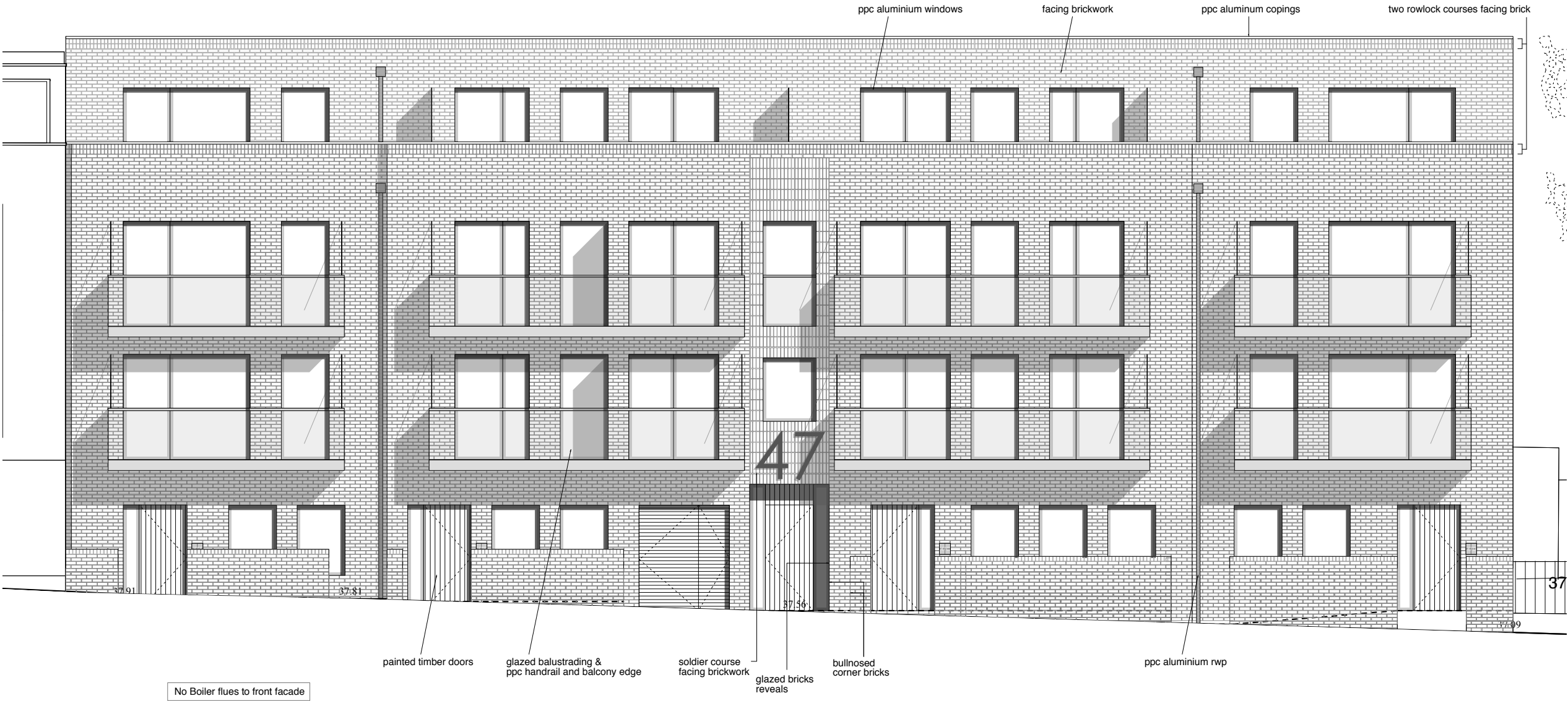
Allcroft Road Front Elevation 1:100@A3