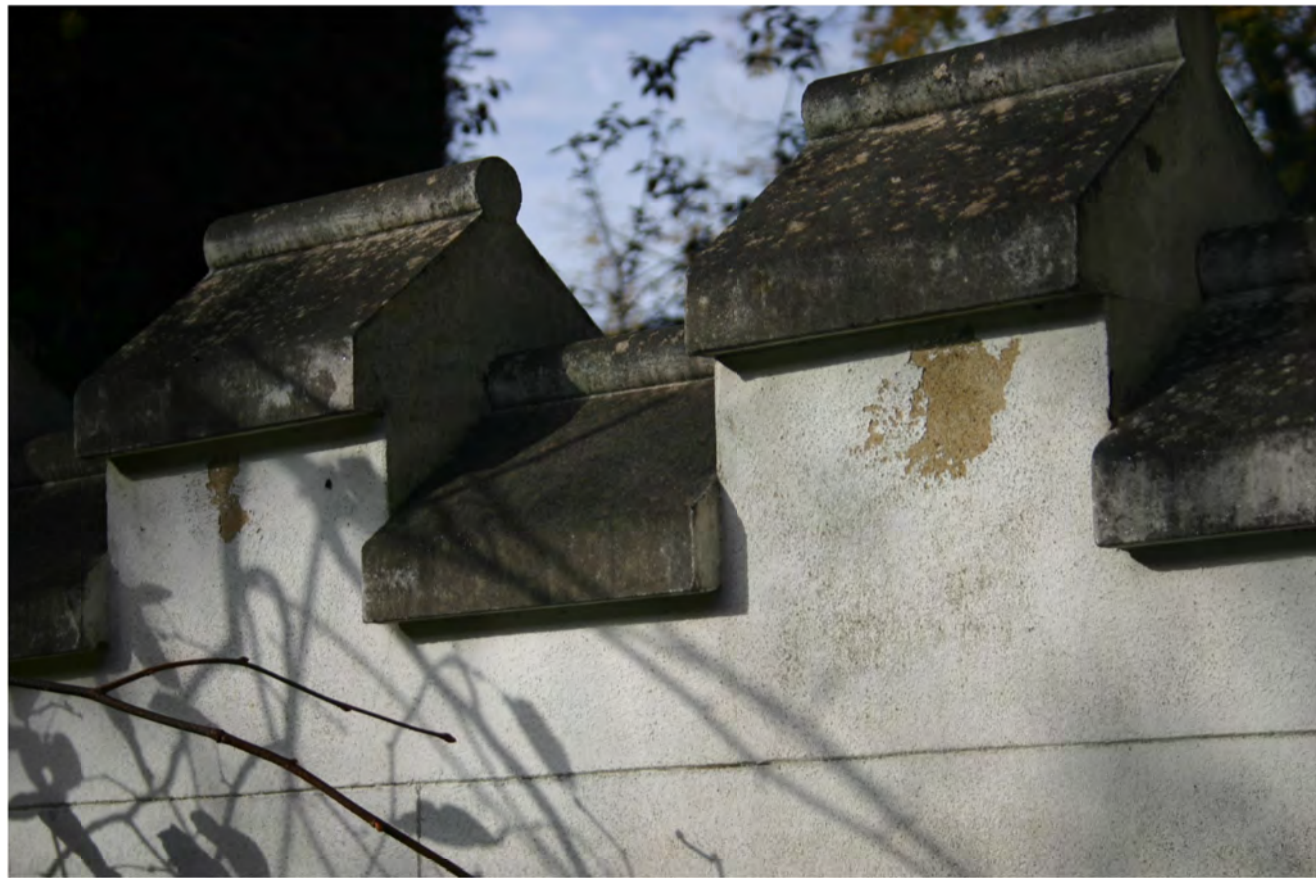
Existing castellated stone coping parapet detail to existing garage.