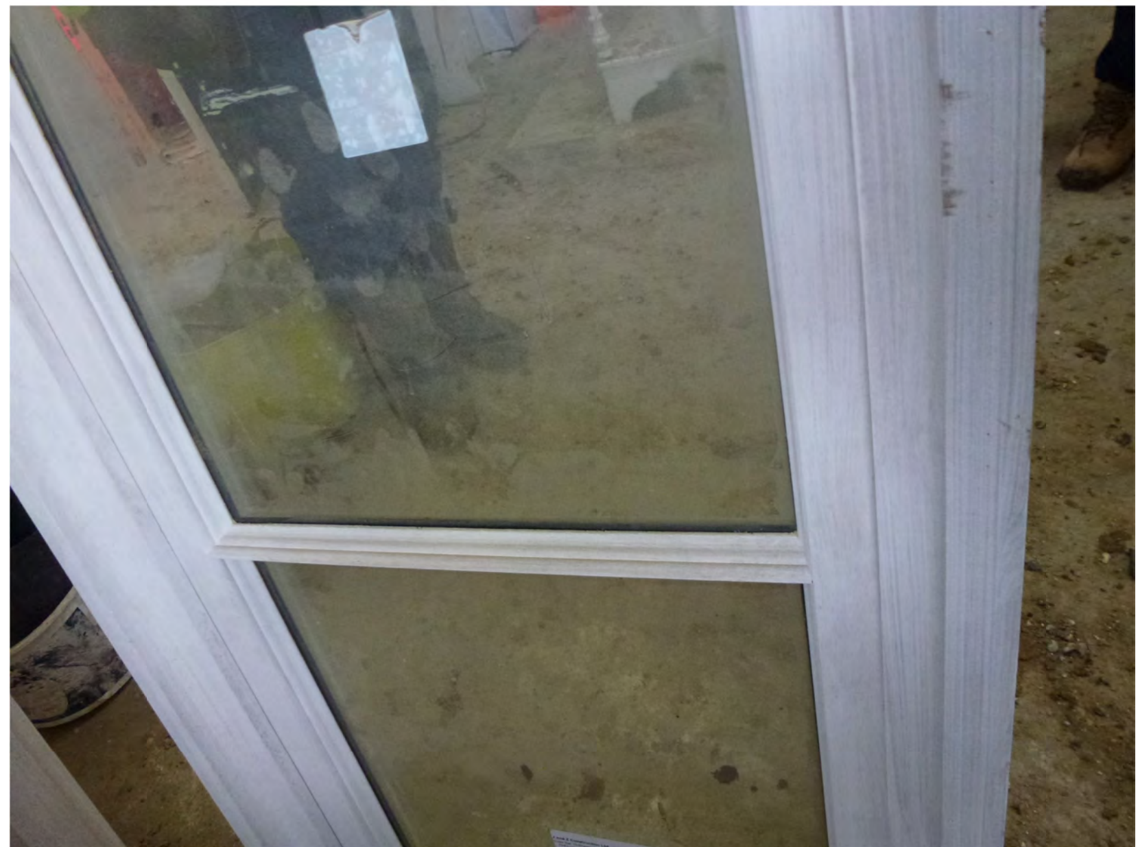
Sample proposed window mock-up by contractor. Glazing bar detail.