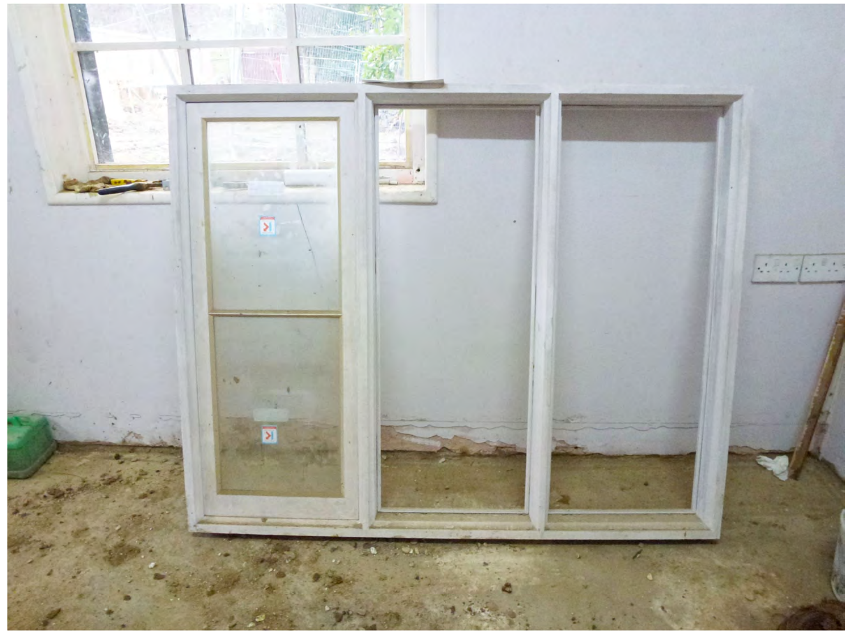
Sample proposed window mock-up by contractor.