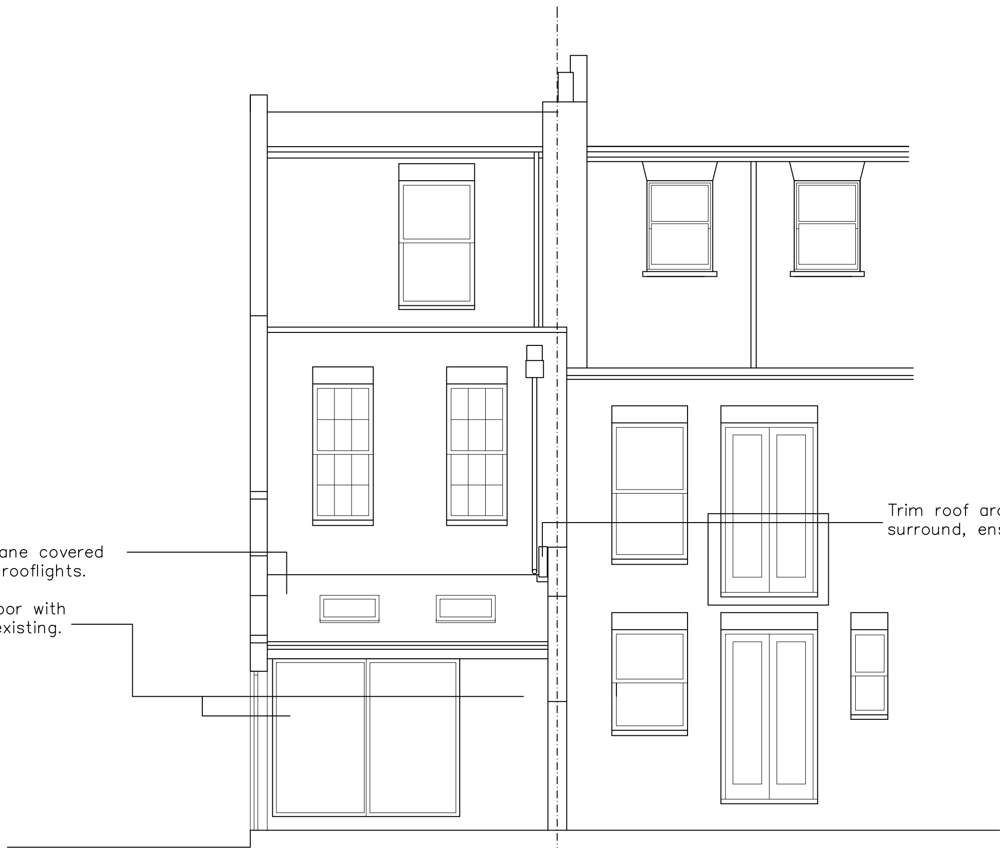
No8. REAR ELEVATION