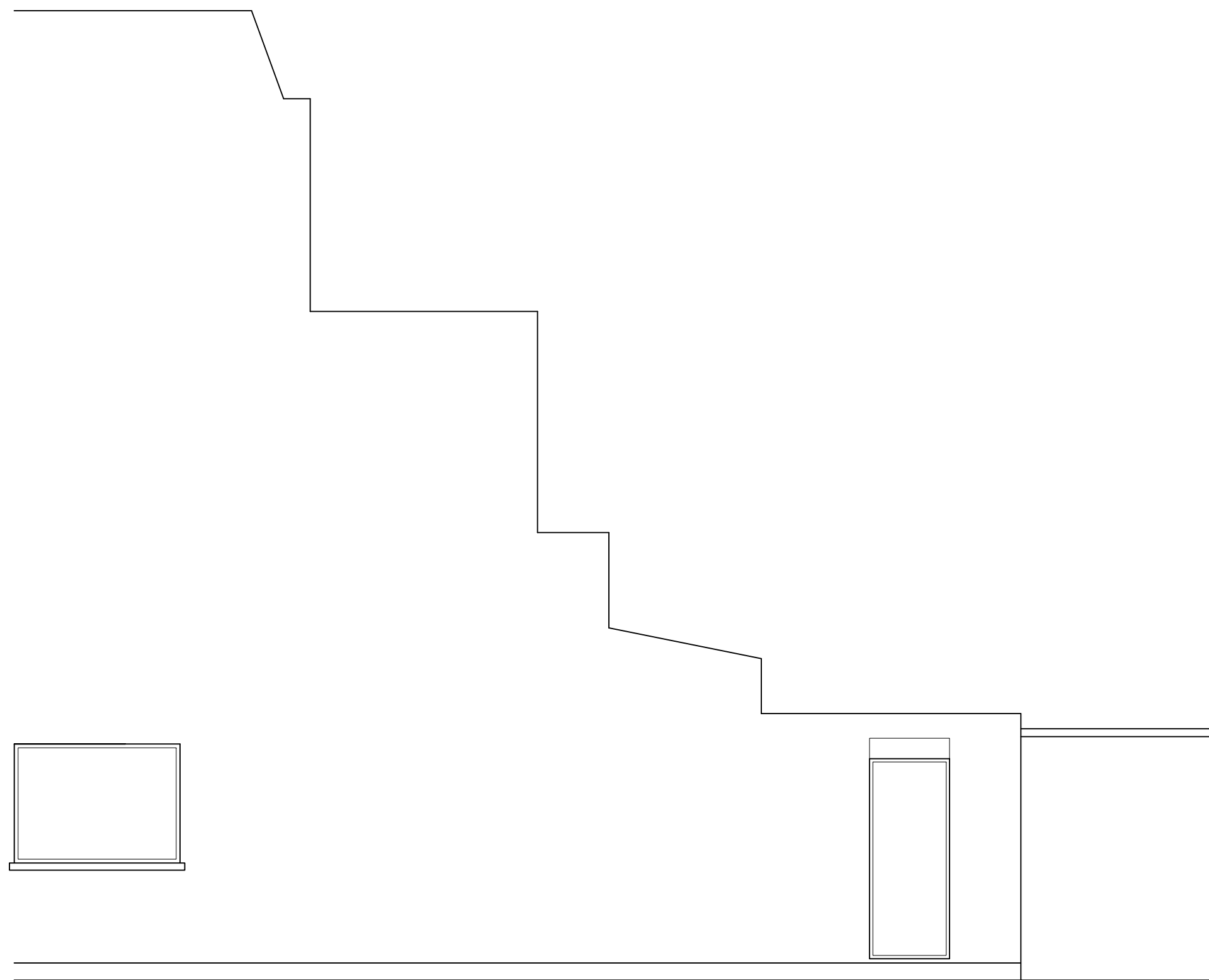
No8. SIDE ELEVATION