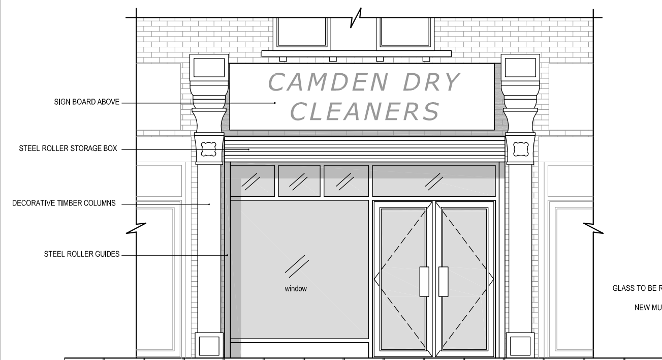
EXISTING FRONT ELEVATION Scale 1:50