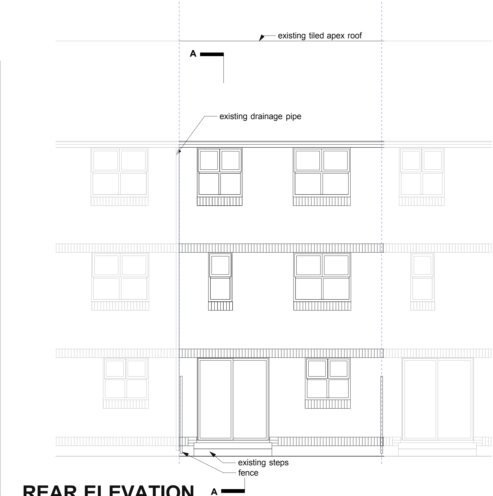
REAR ELEVATION AS EXISTING 1:50@A1 OR 1:100@A3