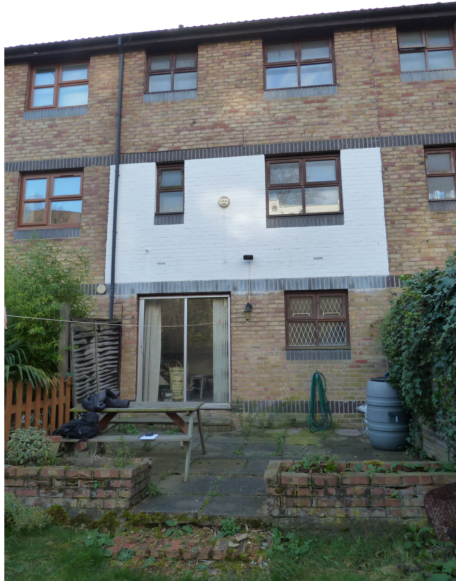
VIEW OF EXISTING REAR ELEVATION