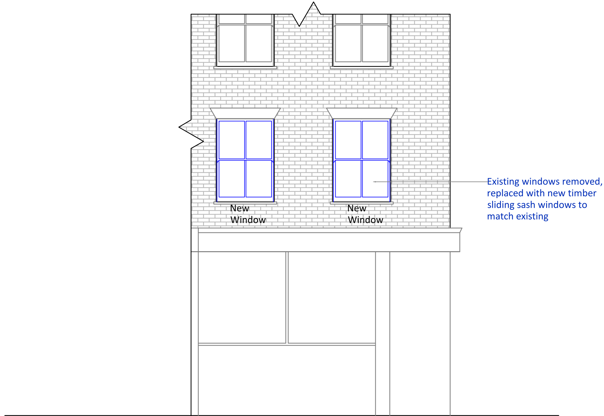
A FRONT ELEVATION 1:50