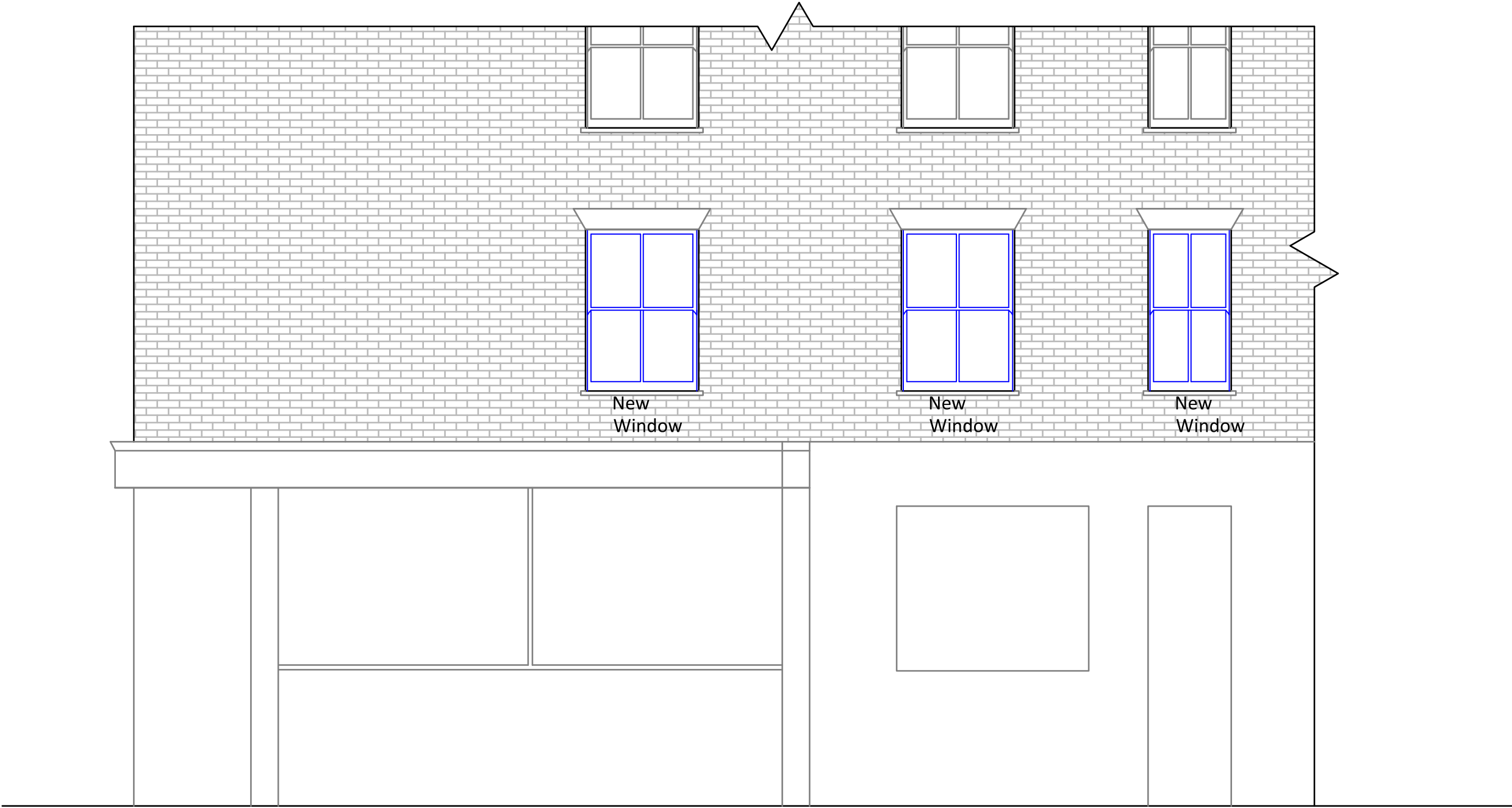
B SIDE ELEVATION 1:50