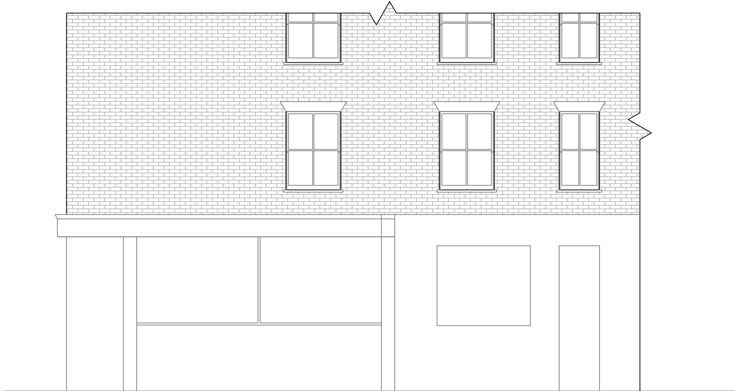
B SIDE ELEVATION 1:50