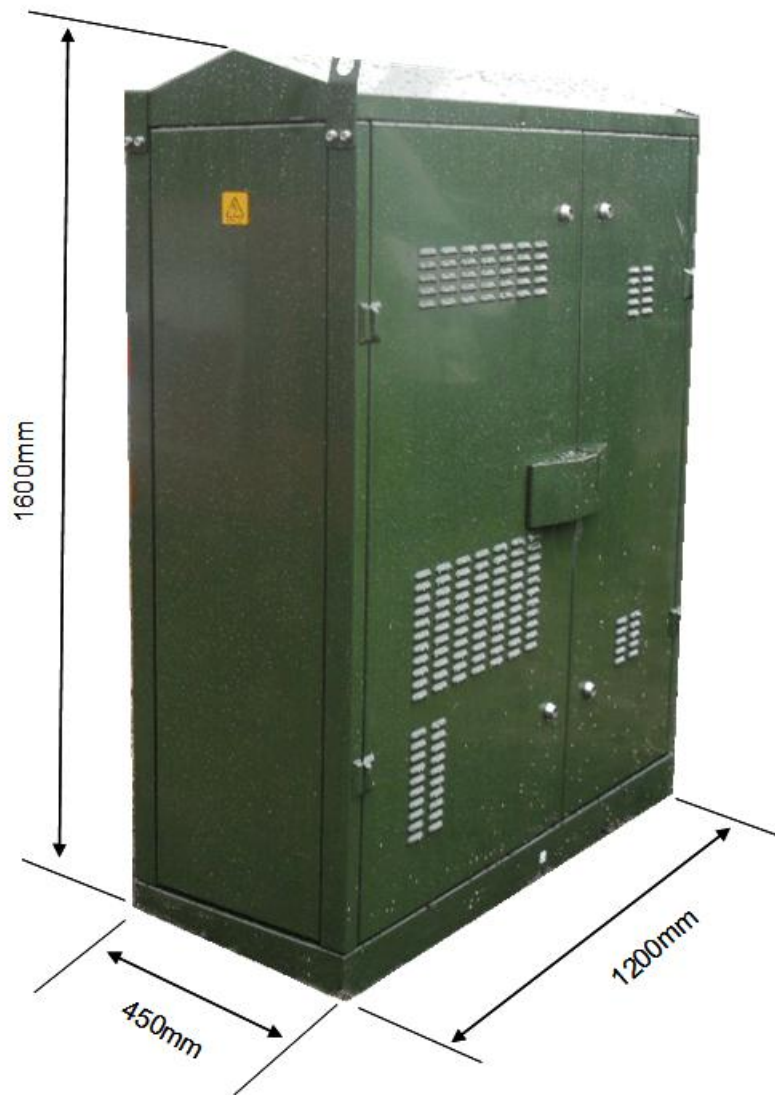
Huawei 288 Cabinet