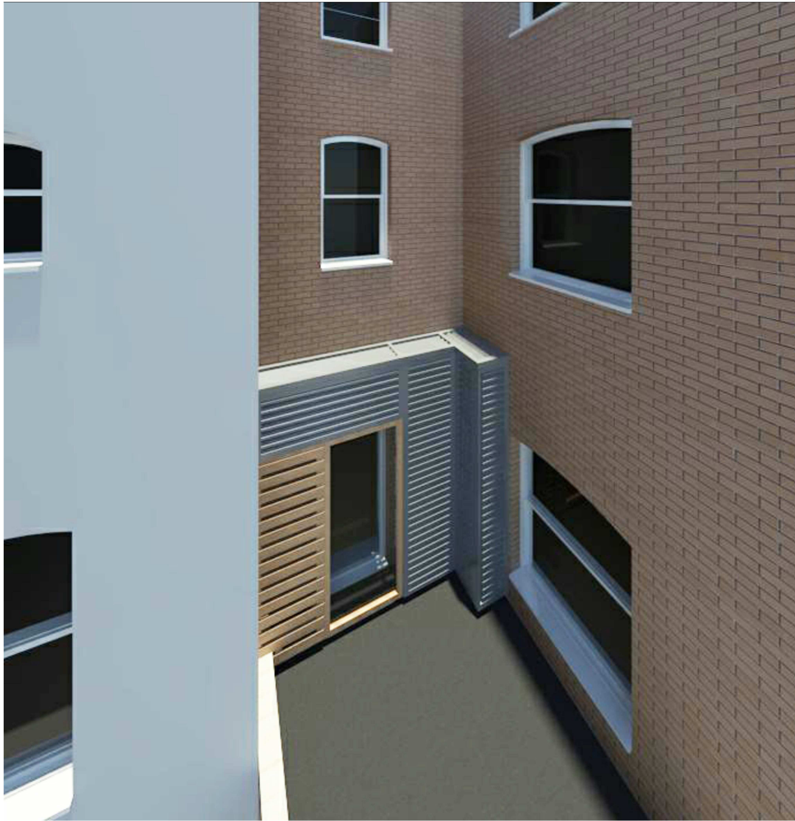
1 VISUAL 2