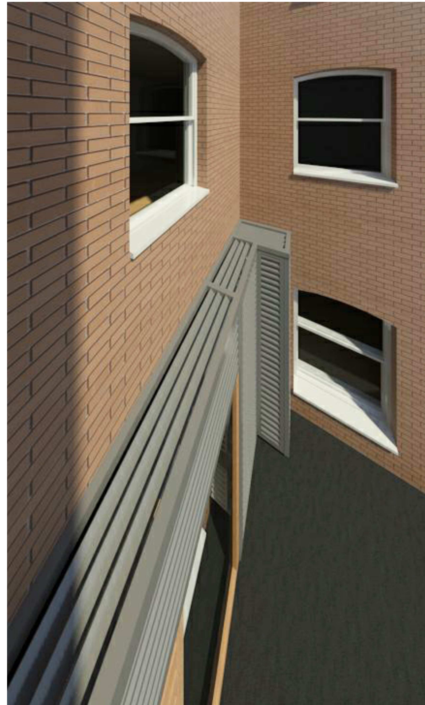
2 VISUAL 3