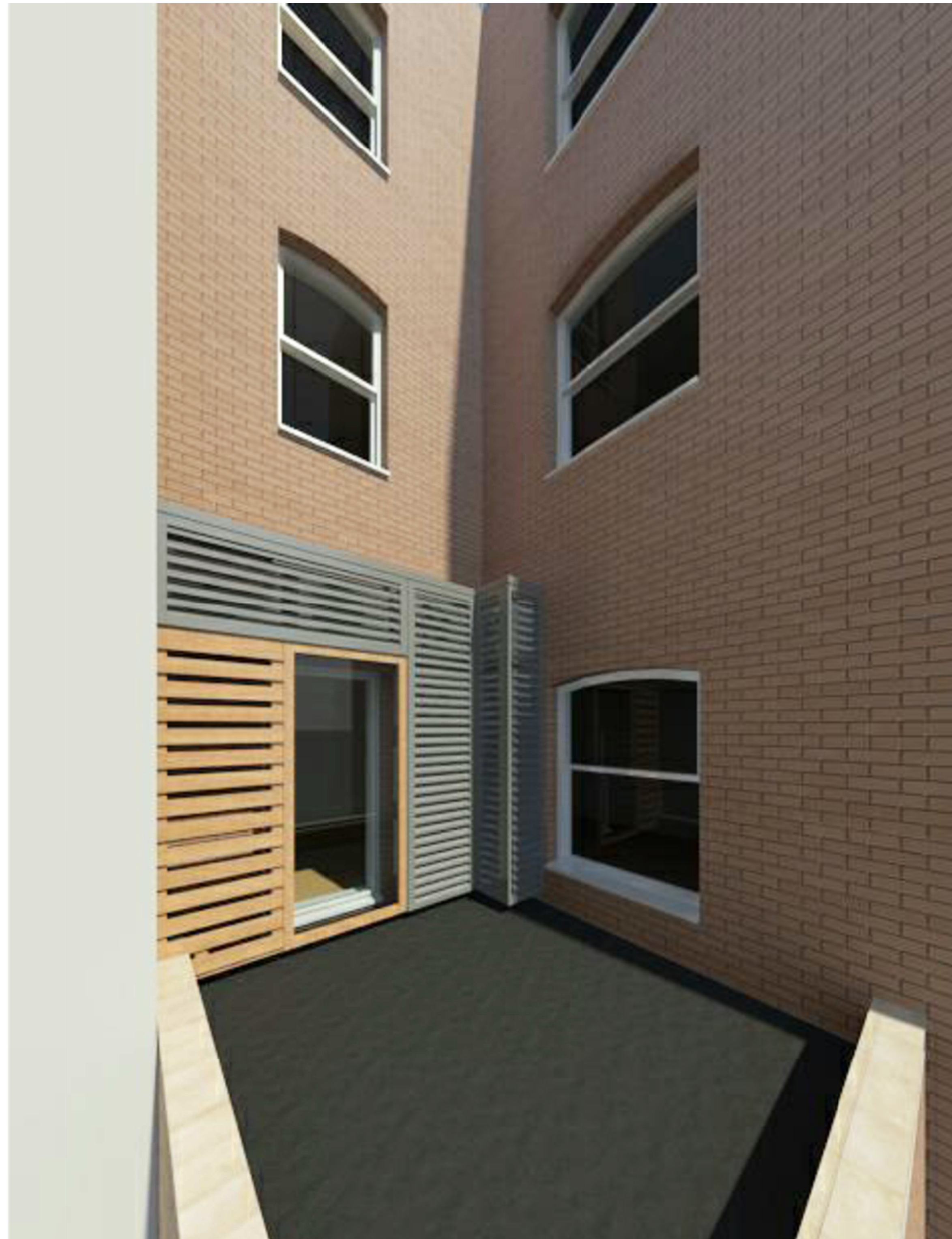
1 VISUAL 1

Please refer to Acoustic Report and Drawings for performance specifications.