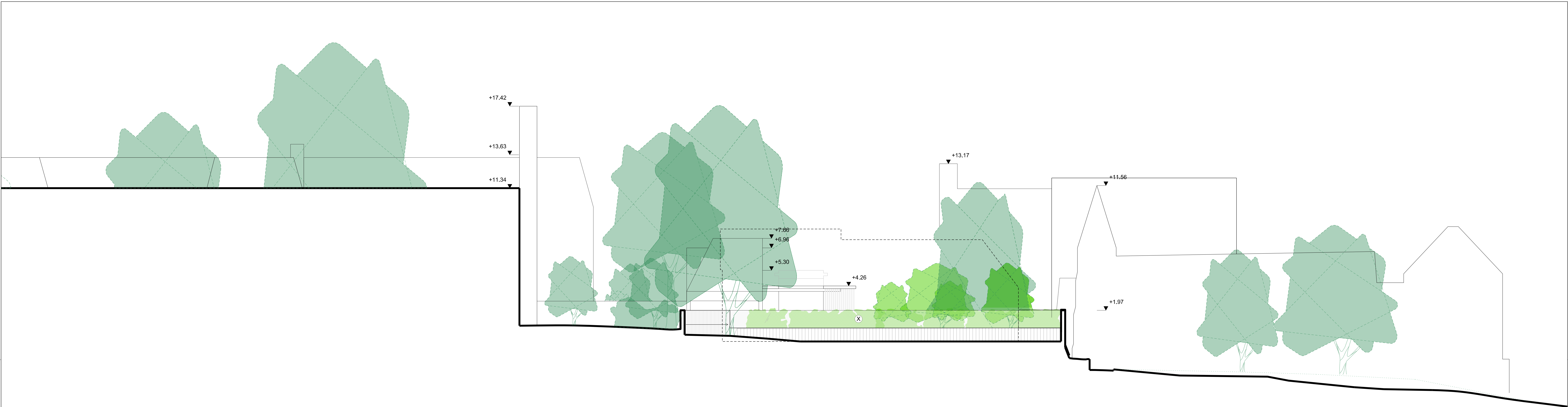
01 Elevation GG'