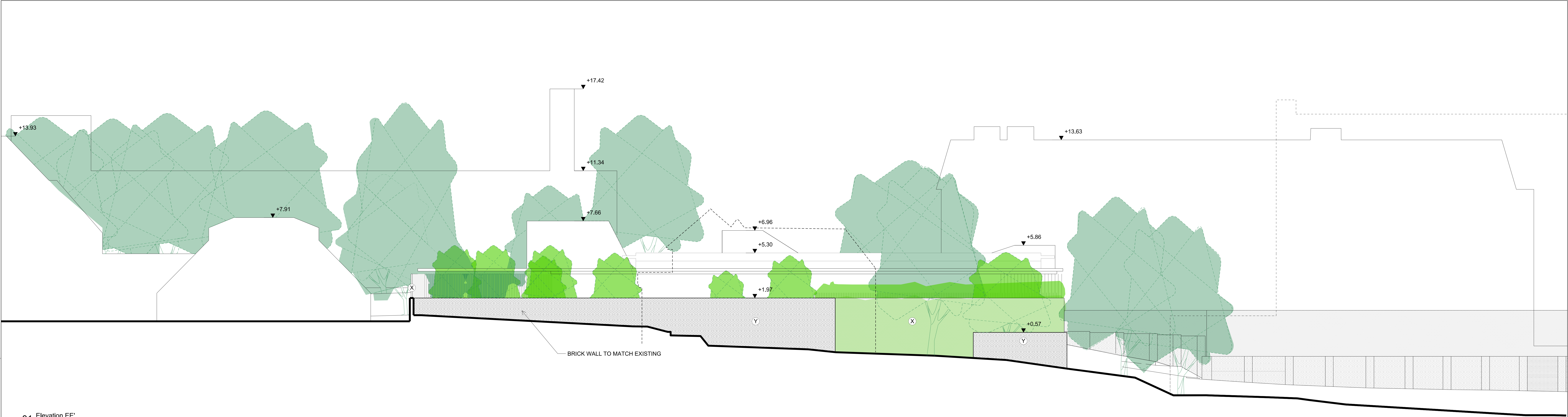
01 Elevation EE' 1:100