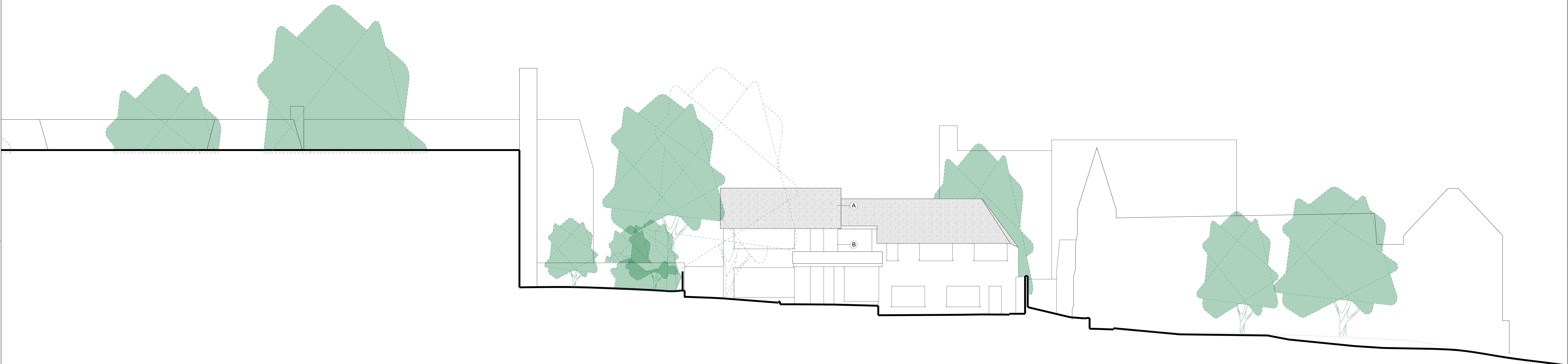
02 Elevation HH'