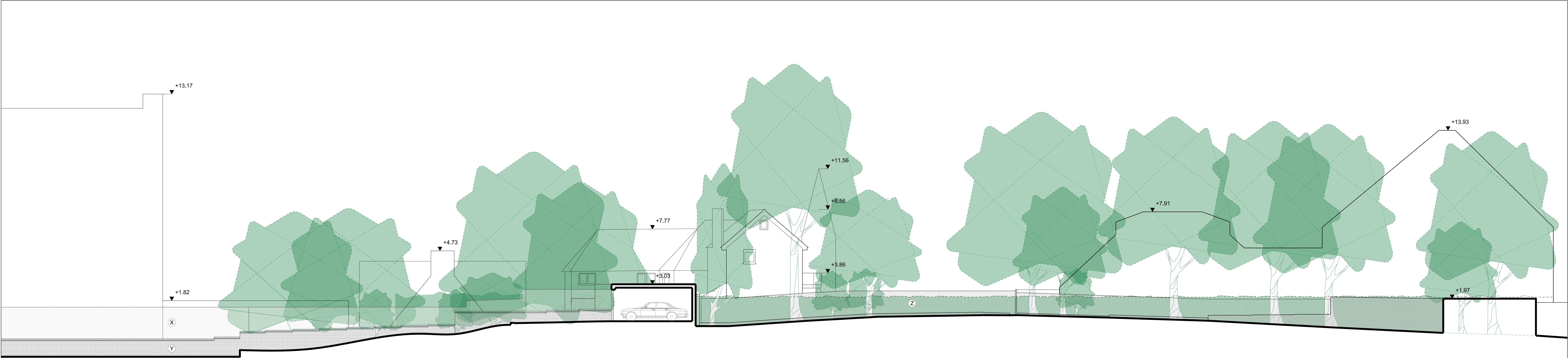
01 Elevation AA'