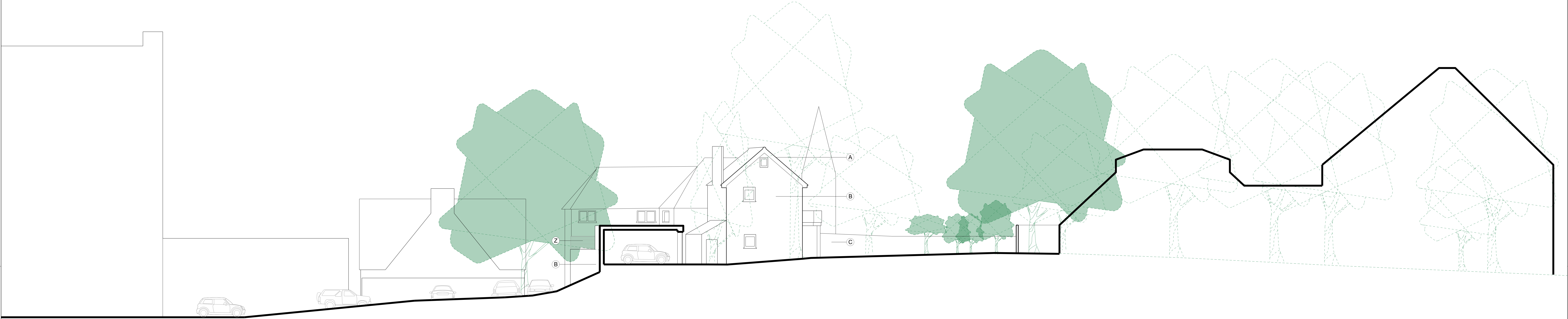
02 Elevation BB'

NORTH BRIDGE HOUSE SENIOR SCHOOL GREENHILL GREENHILL GARAGE HENDERSON COURT ELECTRICAL SUBSTATION 92 FITZJOHN'S AVENUE ST ANTHONY'S SCHOOL