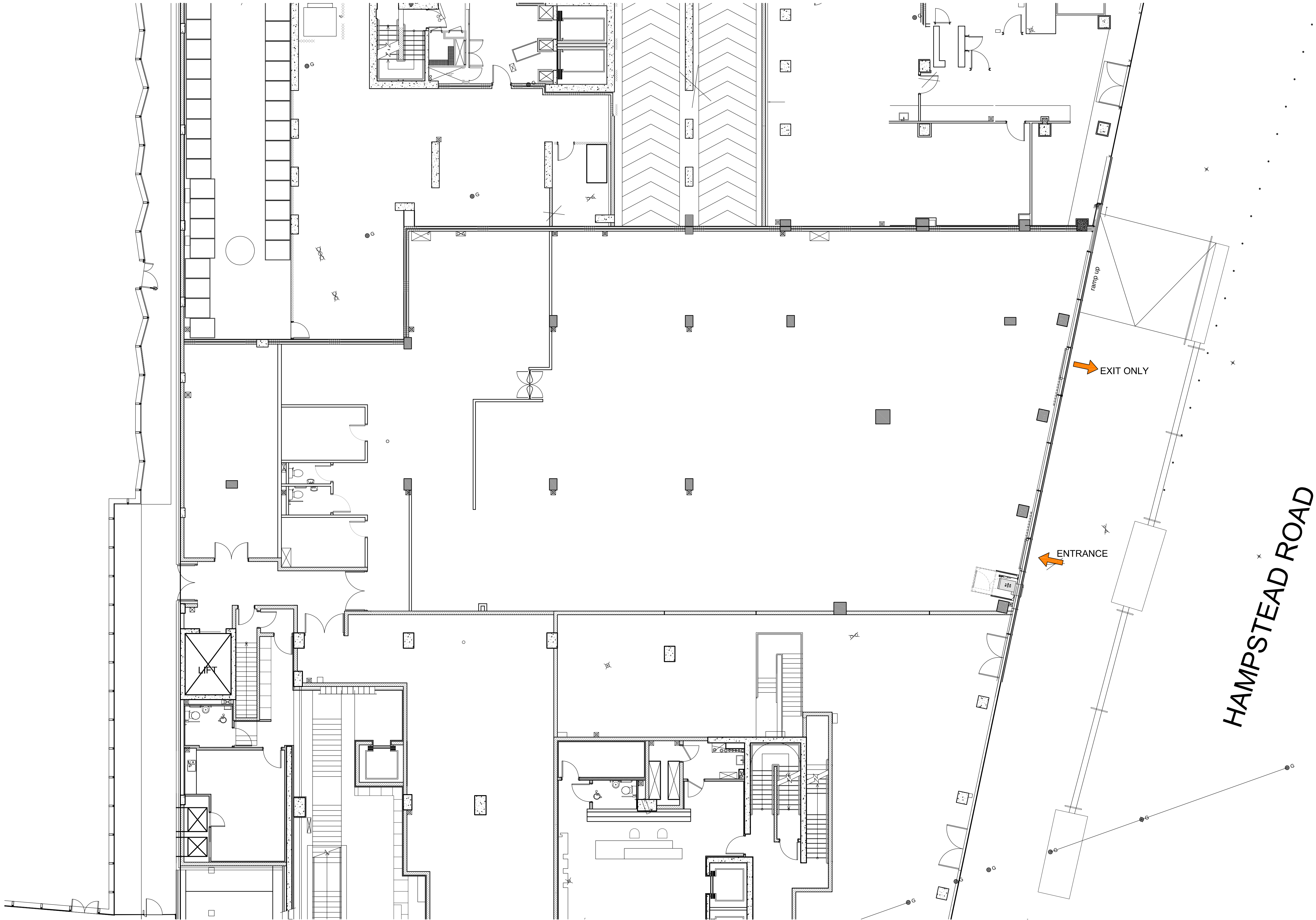
1:100 PROPOSED GROUND FLOOR PLAN