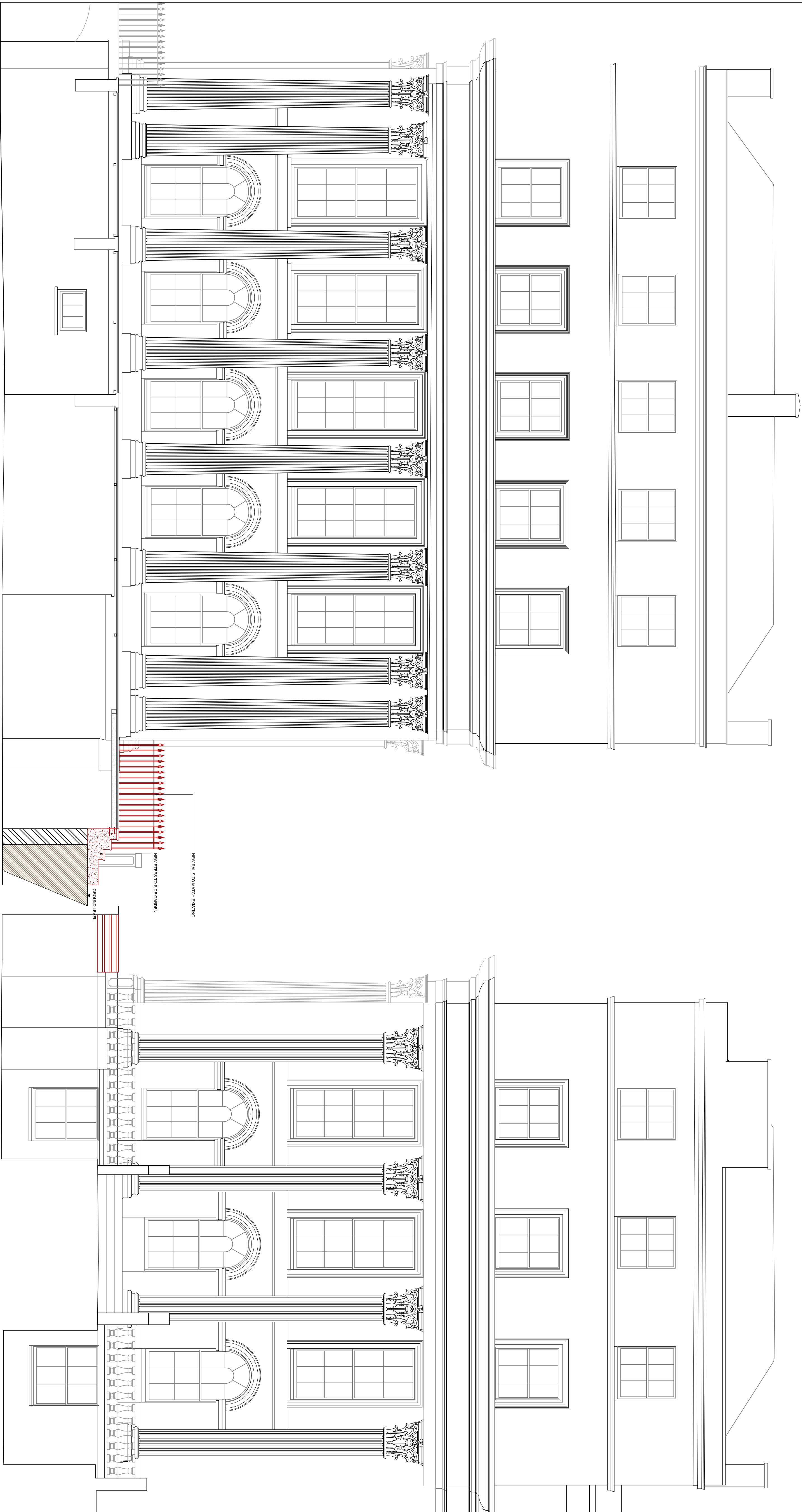
EXISTING ELEVATION 3 - WEST