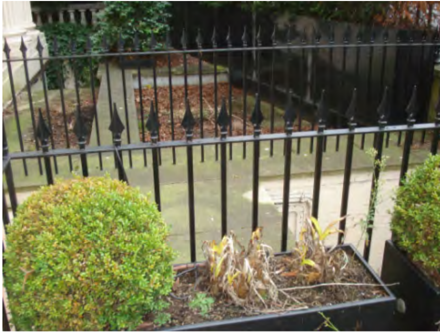
Photo 37 – View of chiller compound (No.41) and top of subterrean room (no. 42) from garden level