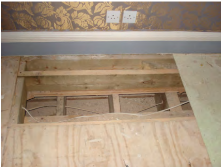
Photo 28 – No. 42 Second floor overlay to structural floor to achieve sensible window cill height