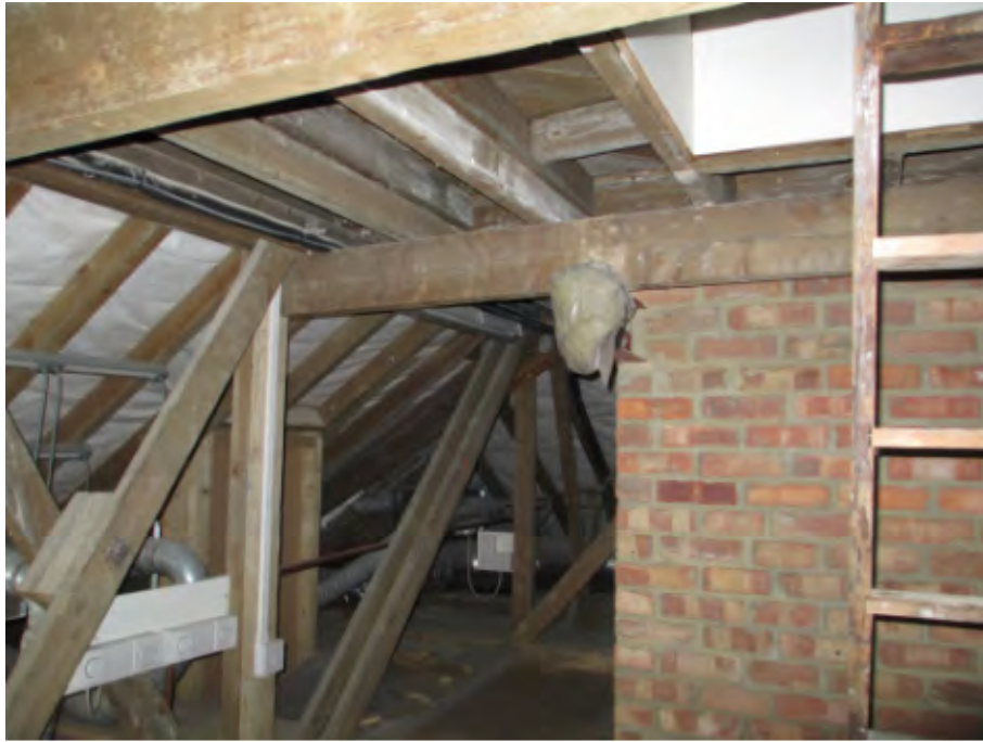
Photo 23 – No. 41 Lift enclosure with old truss trimmed around the walls, secondary truss