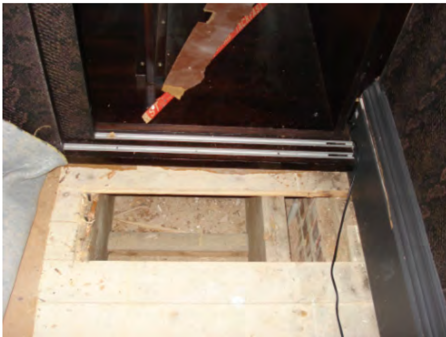
Photo 34 – Third floor timber floor – north fletton brickwork to external wall (1960's)