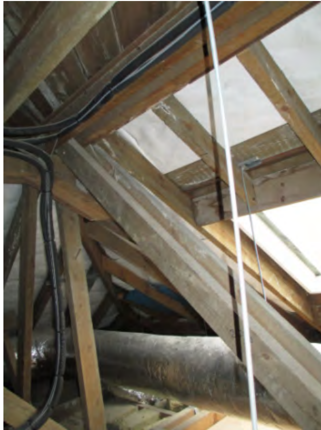
Photo 25 – No. 41 Secondary truss and roof rafters trimmed around rooflight