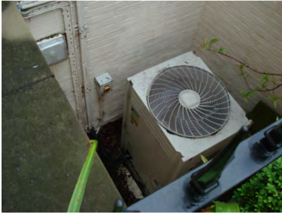
Photo 5 - No. 41 Chiller compound